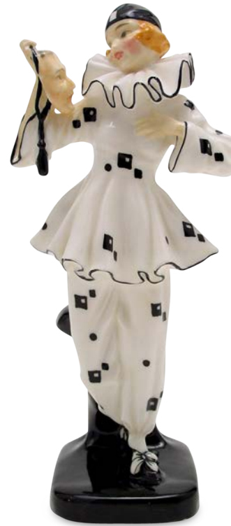
The Mask HN733 c.1925 6.75"H $5,000