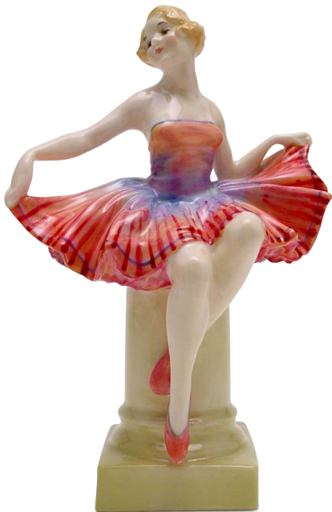
Columbine HN1296 6"H $1,500

"Columbine" is a Royal Doulton figure designed by Leslie Harradine. It was produced from 1928 to 1938. It depicts Columbine, a sassy female comic servant character in the Commedia dell'Arte.