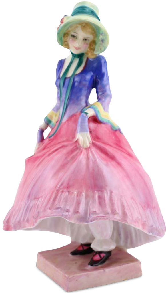
Pantalettes HN1412 7.75"H $700