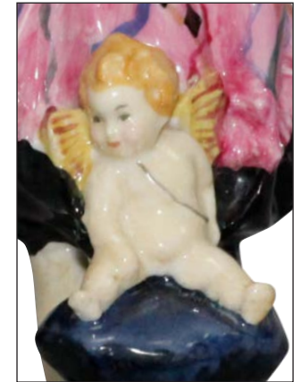
Mam'selle HN786 c.1926 7"H $5,000

"Mam'selle" is a Royal Doulton Art Deco figure designed by Leslie Harradine. The figure embodies the traditionally-depicted naughtiness of the French Mademoiselle with an early modern twist. Behind her on a tree stump sits a tiny winged cherub.