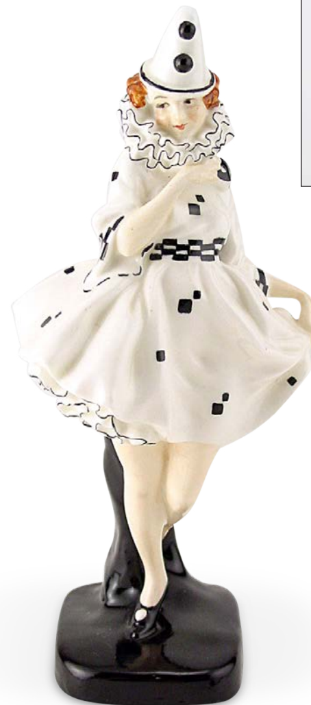
Pierrette HN644 (Bone China) 7.25"H $1,500