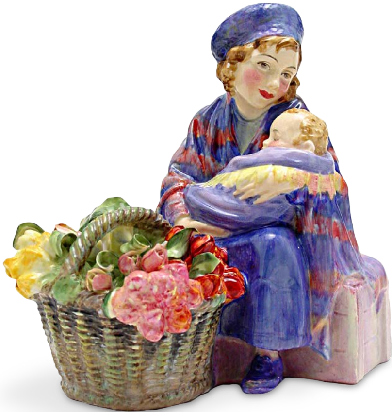
Curly Knob HN1627 6"H $800

A highly sought after and rare Royal Doulton figure, "Curly Knob" was designed by Leslie Harradine, and produced from 1934 to 1949. It depicts a seated young mother and baby, with a large basket of colorful flowers.