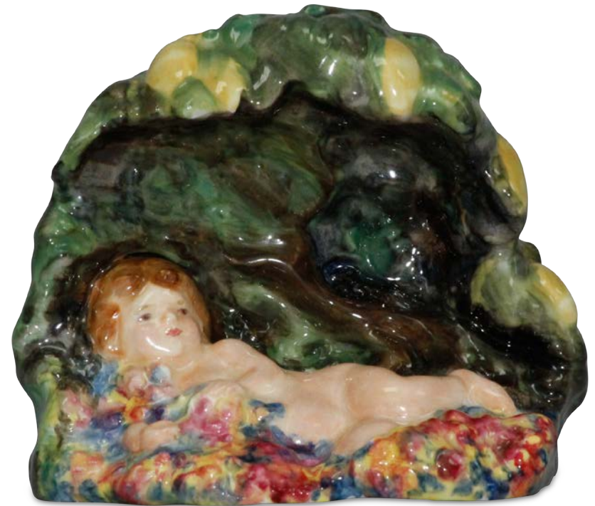
Under the Gooseberry Bush HN49 3.5"H $4,750

"Judge and Jury" is a Royal Doulton figure designed by J.G. Hughes, and produced from 1927 to 1938. This delightful figure is modeled as a child wearing the wig and ermine robes of a British judge, passing sentence on his puppy "defendant," before a "jury" of dolls in a basket.