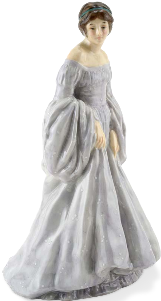
Pretty Lady HN70 9.5"H $4,250

"Pretty Lady" is a Royal Doulton figure designed by Harry Tittensor, and issued from 1916 to 1938. This is a gorgeous color variation, hand painted in a lustrous grey colorway and modeled as a young woman wearing a spectacular gown, and a circlet on her head.