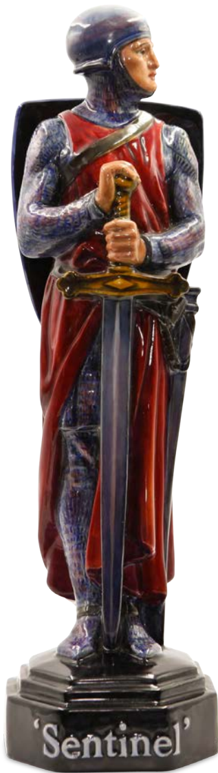
Sentinel HN523 17.5"H $23,000

"The Sentinel" is a Royal Doulton advertising figure, produced for the Sentinel Waggon Works of Shrewsbury, United Kingdom. It is modeled as a Medieval figurative effigy monument of a knight. Impressed date 1921.