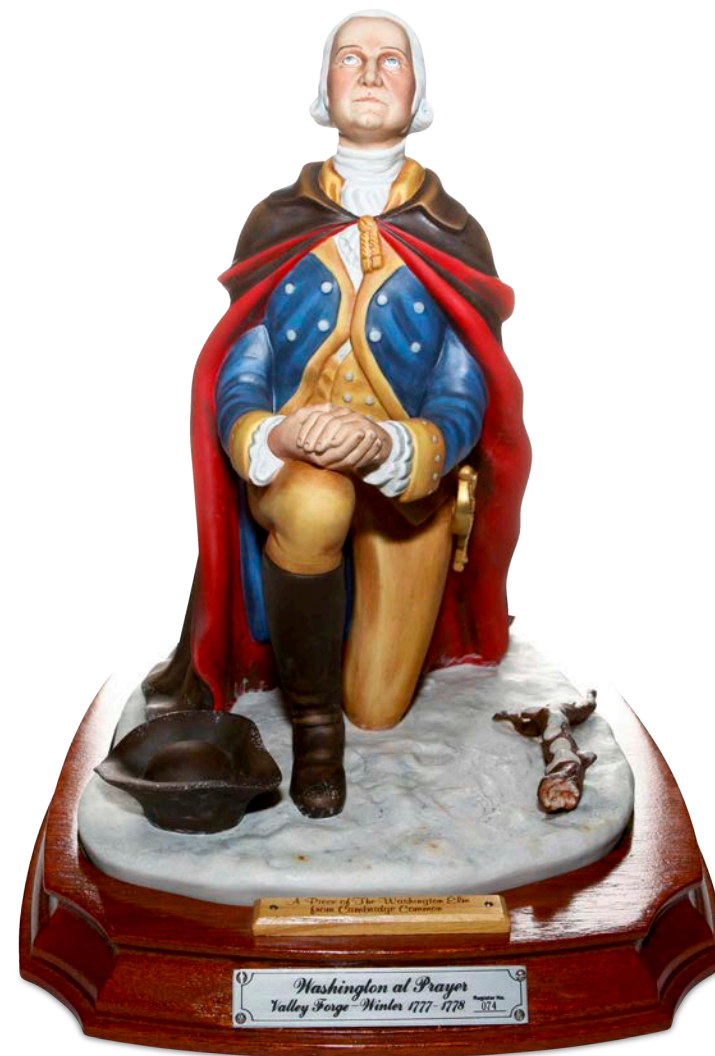
George Washington at Prayer HN2861 12.5"H $1,500