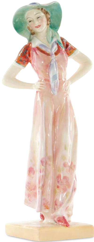
The Lambeth Walk HN1881 10.75"H $4,500