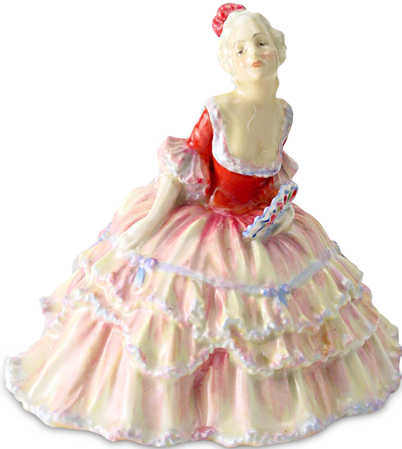
Lisette HN1523 c.1932 5.25"H $1,500