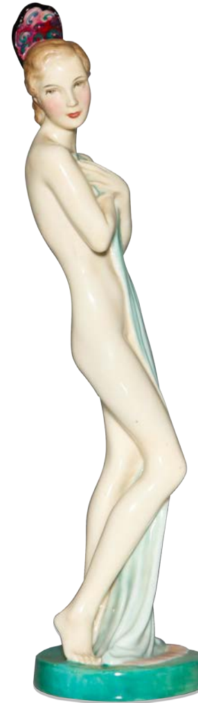
Dawn HN1858 (with Head Dress) 10"H $3,000