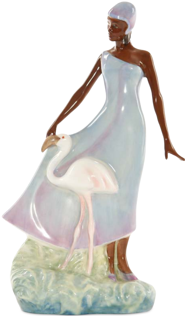
Figure with Flamingo (Prototype) 9.25"H $5,500

This Royal Doulton Prototype figure was painted by Mick Woodhouse, a Royal Doulton Prestige painter from 1956 to 2005. Painted in a spectacular blue, brown, lavender, green and pink colorway, it is modeled as a woman from the tropics admiring a young flamingo.