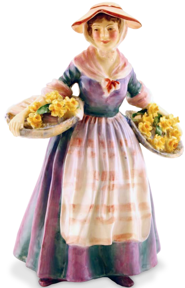
Daffy Down Dilly HN1713 8.25"H $1,650