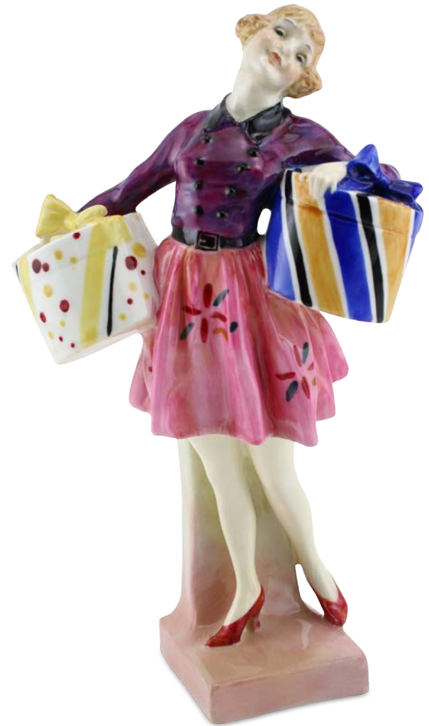
Midinette HN1289 9"H $5,500

"Folly" is a Royal Doulton figure, designed by Leslie Harradine, in production from 1936 to 1949. Modeled as a mischievous Pierrette (a female "Pierrot," or sad clown), carrying balloons and wearing a cone hat, ruffled collar and short dress.