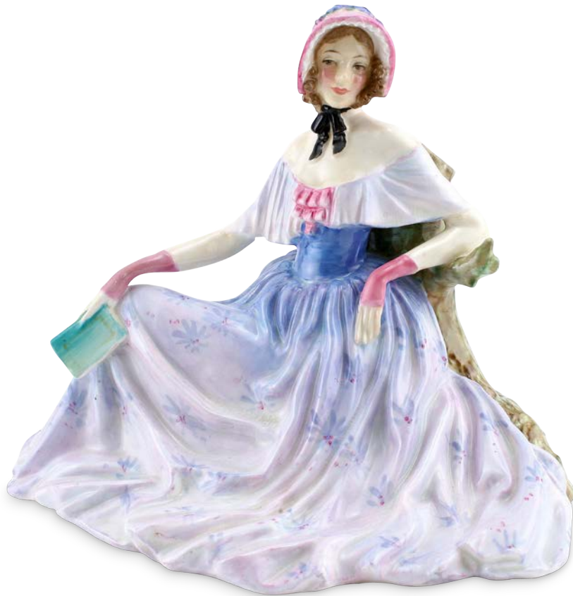
Memories HN1856 6"H $1,100

"Memories" is a Royal Doulton figure designed by Leslie Harradine, and issued from 1938 to 1949. Painted in a blue, green, rose and pink colorway, it is modeled as a reclining, early 19th century lady, wearing a bonnet and slim-waisted dress, holding a book of poetry.