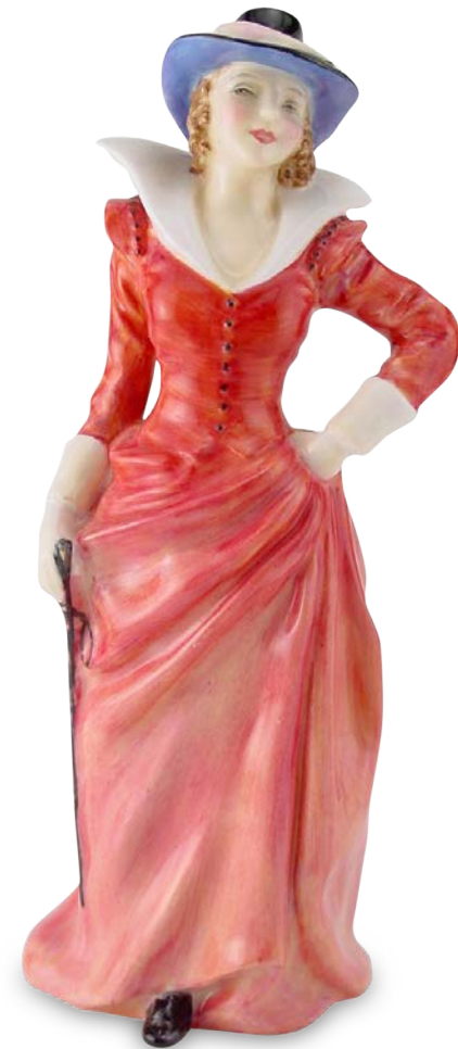
Marianne HN2074 7.25"H $700