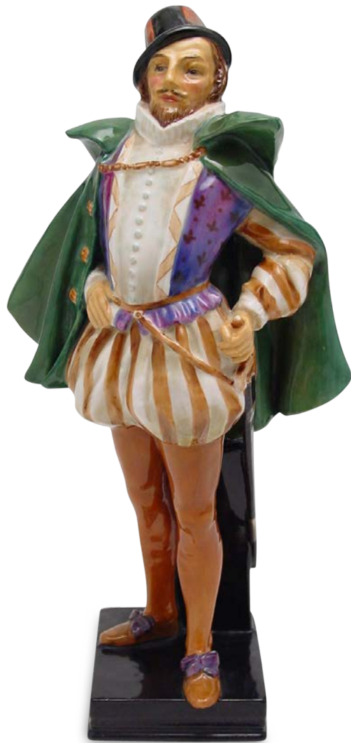
Sir Walter Raleigh HN1742 10.5"H $3,000