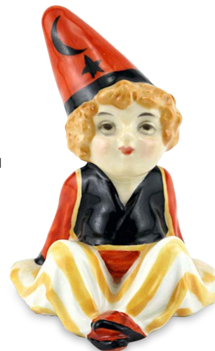
Cassim HN1232 c.1927 3"H $1,500