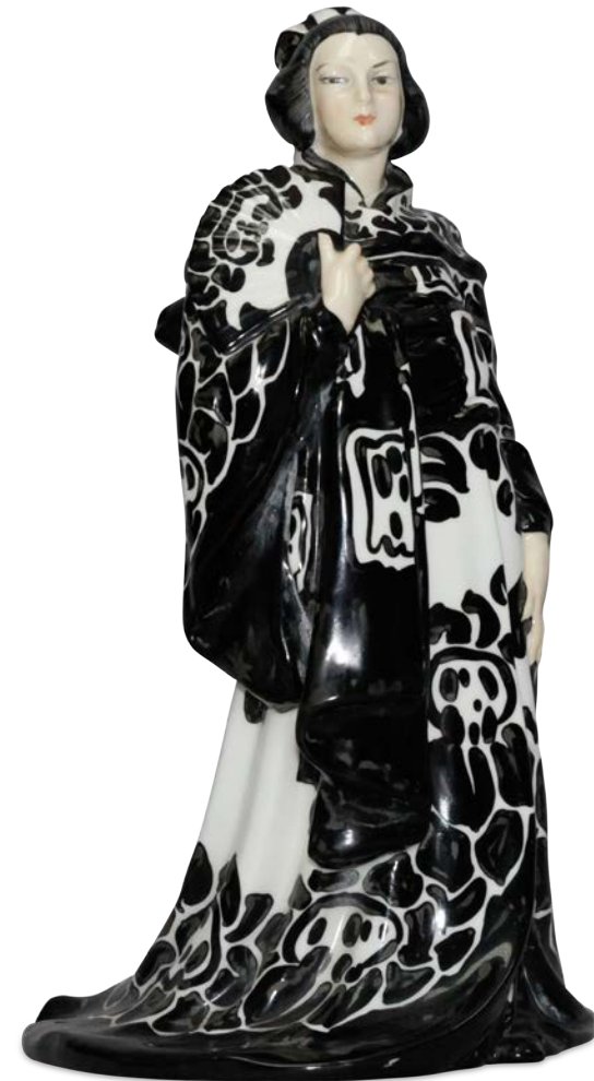
Japanese Lady HN634 10.75"H $7,500