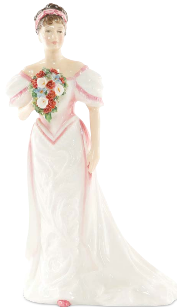
Bride (Prototype) 8.25"H $3,200

This beautiful variation of Royal Doulton's "Bride" figure, produced in 1951, is based on the model of "Sweet Maid" HN2092. This colorway variation has a detailed wedding dress in purple, white, and beige.