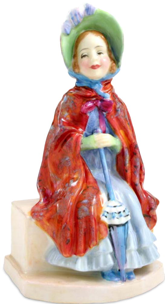
Little Lady Make Believe HN1870 6.25"H $925