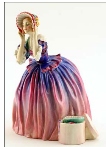
The Choice HN1960 c.1941 7.25"H $3,500