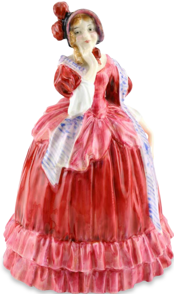
Quality Street HN1211 7.25"H $1,000

A beautiful Royal Doulton figure, "Quality Street" is modeled as a woman wearing a stylish dress and ladies bonnet, and decorated in a red colorway. Although record of the designer remains unknown, the figure was issued from 1926 to 1936.