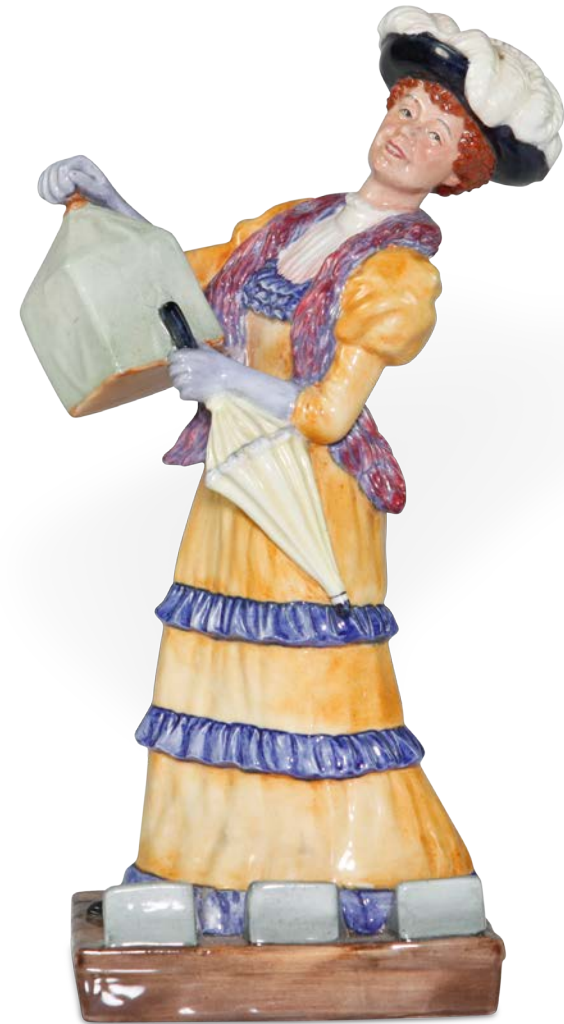
Lady Carrying Birdcage and Umbrella (Prototype) "H $8,500

This Royal Doulton Prototype figure was painted by Mick Woodhouse, a Royal Doulton Prestige painter from 1956 to 2005. Painted in a spectacular blue, brown, lavender, green and pink colorway, it is modeled as a woman from the tropics admiring a young flamingo.