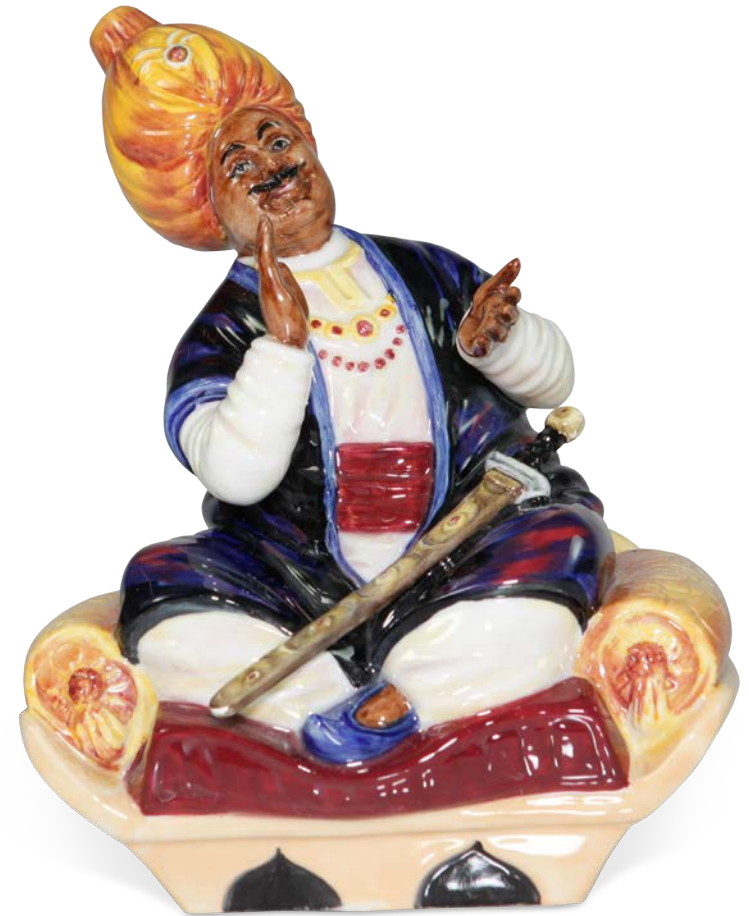
Sultan Seated with Sword (Prototype) 7.5"H $7,500

A Royal Doulton Prototype figure of "Athos," one of the main characters in the 1844 Alexandre Dumas novel "The Three Musketeers." Modeled by Robert Tabbenor in 1978, this figure was part of a Three Musketeers series that was planned but not produced. Athos – noble, handsome, and secretive – is modeled wearing the uniform of the King's Musketeers.