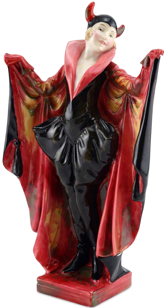
Marietta HN1341 c.1929 8"H $1,000

"Marietta" is a Royal Doulton Art Deco figure produced between 1929 and 1938. Designed by Leslie Harradine, it is modeled as Marietta, the heroine of the 19th century comic operetta, Die Fledermaus, dressed in a striking bat costume.