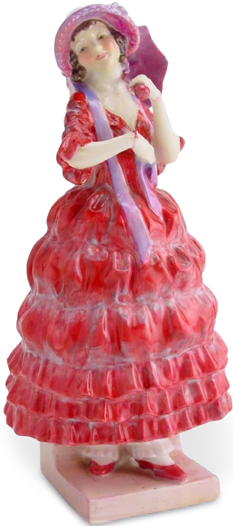
Helen HN1572 8"H $2,500