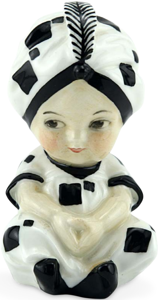
Boy with Turban HN1213 c.1934 3.75"H $2,800