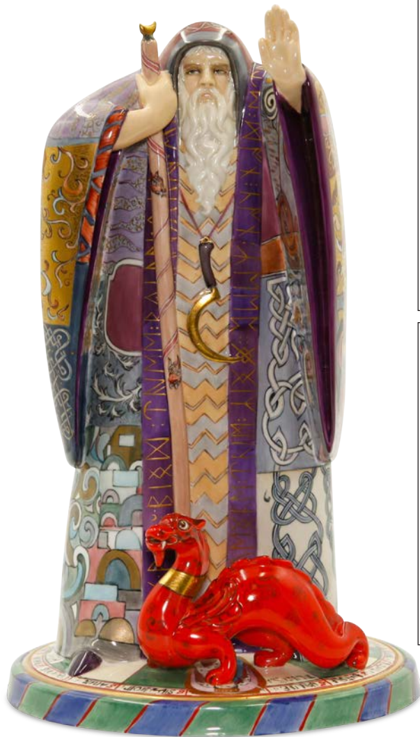
Merlin (Prototype) 12.5"H $8,500

This Royal Doulton Prototype figure of "Merlin" the wizard is depicted in a brightly colored hooded cloak, decorated in a purple, green, gold and brown colorway, with Celtic knots and runic sigils. He stands on a circular base, with a small red dragon – an important image in Arthurian romances – at his feet.