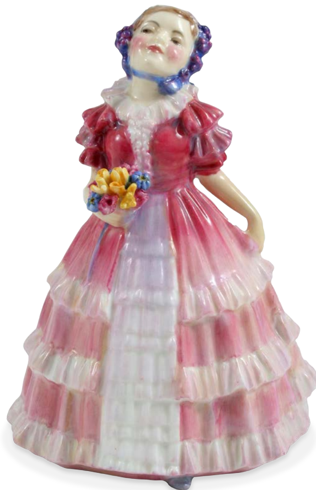
Ruby HN1724 5.25"H $550