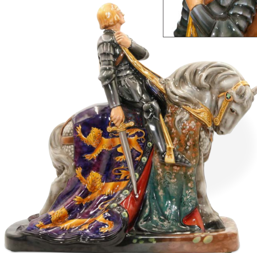
St. George 16"H $3,500

"St George" is a Royal Doulton figure, issued from 1950 to 1979, and based on a 1915 study by Stanley Thorogood. Modeled as an armored warrior, with blonde hair in a Prince Valiant style, and superb polychrome decoration. His warhorse is painted dappled grey, and is covered in a spectacular caparison with the Three Lions emblem of England.