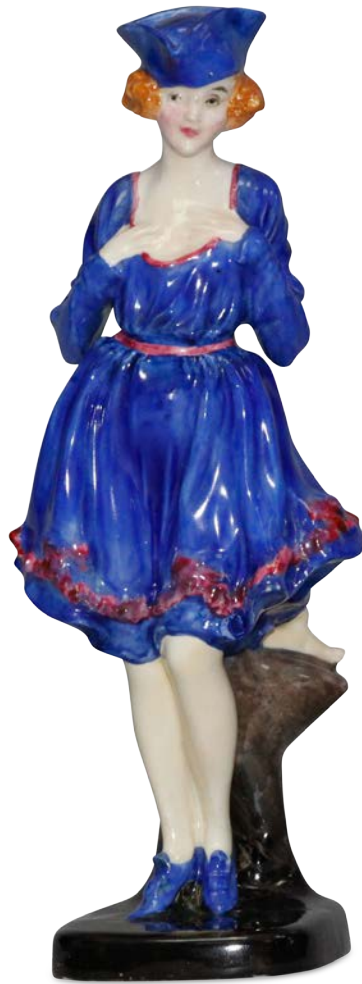
Mam'selle HN659 c.1925 7"H $5,500

"Mam'selle" is a Royal Doulton Art Deco figure designed by Leslie Harradine. The figure embodies the traditionally-depicted naughtiness of the French Mademoiselle with an early modern twist. Behind her on a tree stump sits a tiny winged cherub.