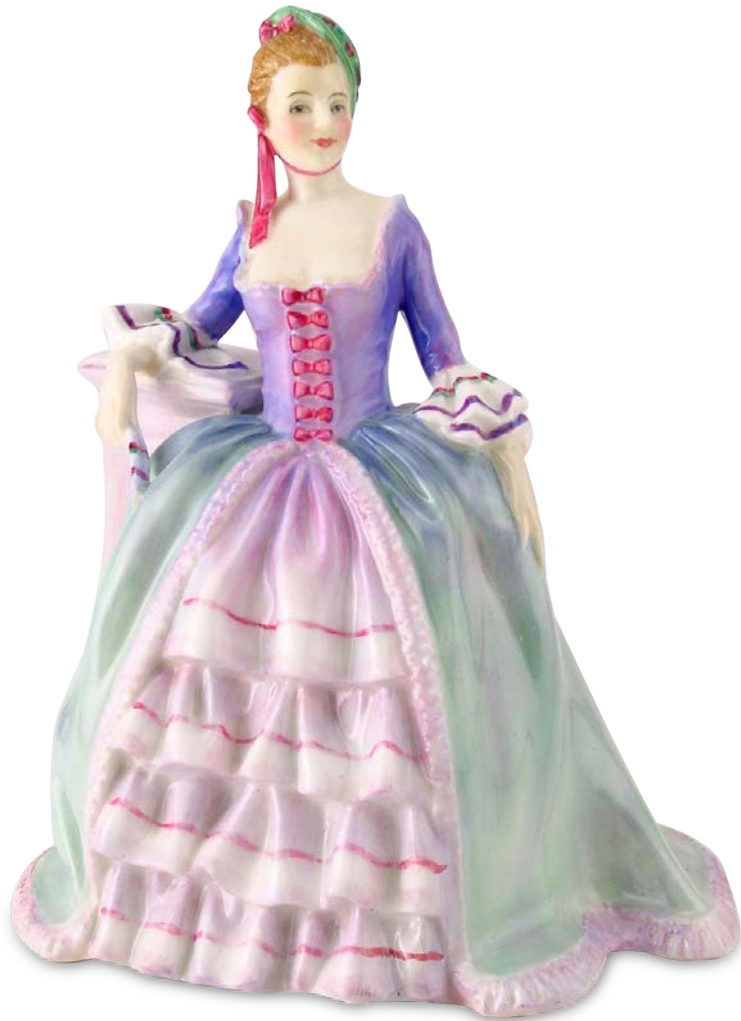
Eleanore HN1753 7"H $1,200

"Eleanore" is a Royal Doulton figure designed by Leslie Harradine and produced from 1936 to 1949. She is depicted as a lady of the Stuart Period dressed in fashionable gown, skirts, and bodice.