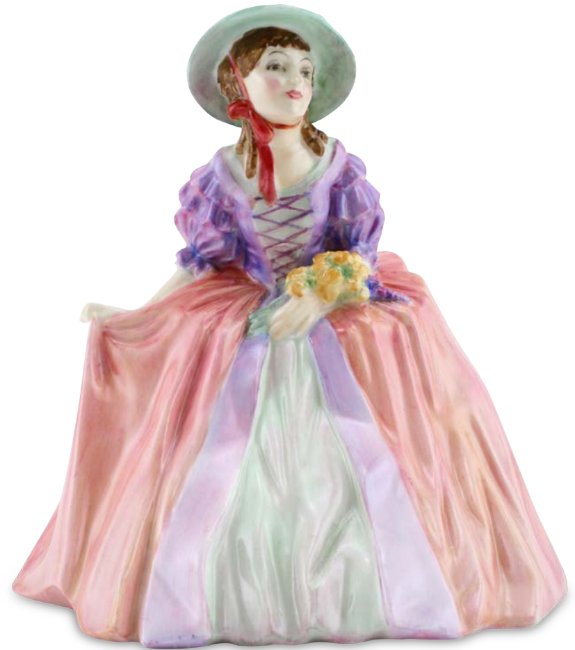
Delicia HN1662 5.75"H $1,000