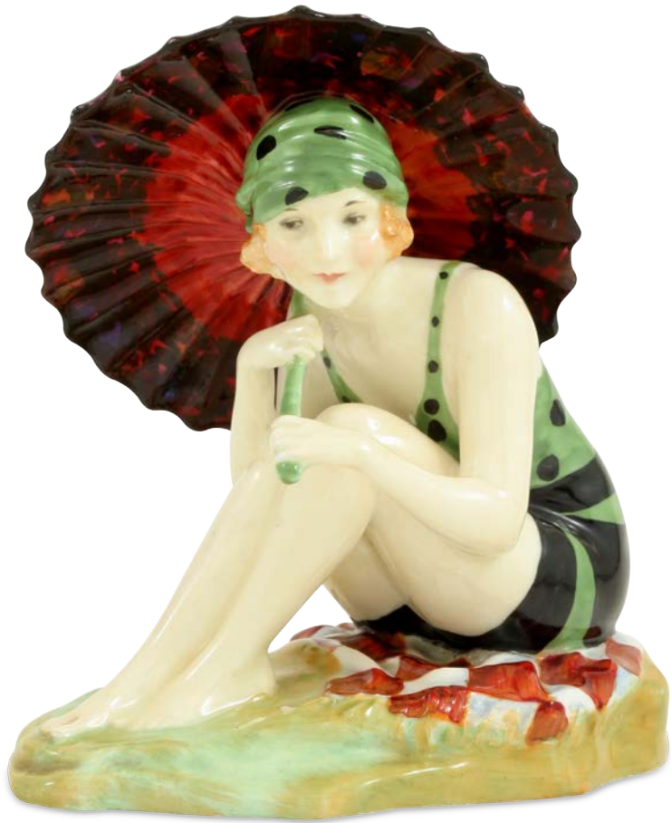
Sunshine Girl HN1344 5"H $9,500

"Sunshine Girl" is a Royal Doulton Art Deco figure designed by Leslie Harradine, inspired by ladies' swimsuit fashions of the era. Issued from 1929 to 1938, it depicts a young woman wearing a 1920s swim suit and bathing cap, and holding a parasol.