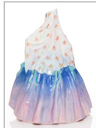
Modena HN1845 c.1938 7.25"H $1,800