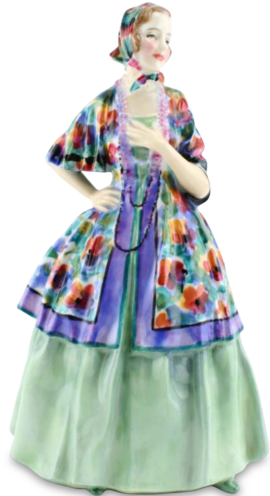
Jasmine HN1862 7.25"H $1,000