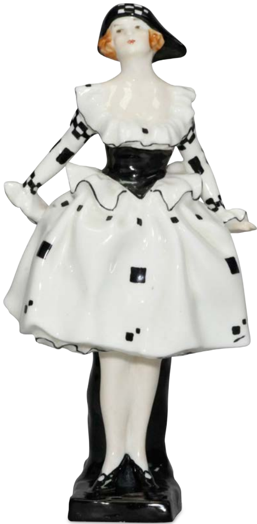
Harlequinade HN711 c.1925 7"H $5,000

"Harlequinade" is a Royal Doulton figure designed by Leslie Harradine, inspired by the British comic theatrical genre called Harlequinade.