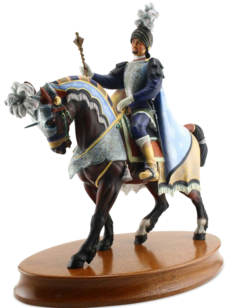
Palio HN2428 17.5"H $6,500