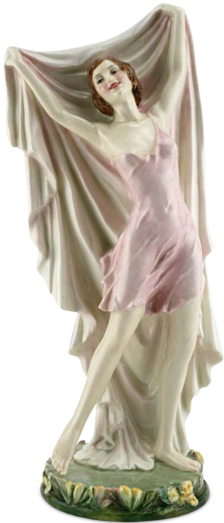
Coming of Spring HN1722 12.5"H $4,500