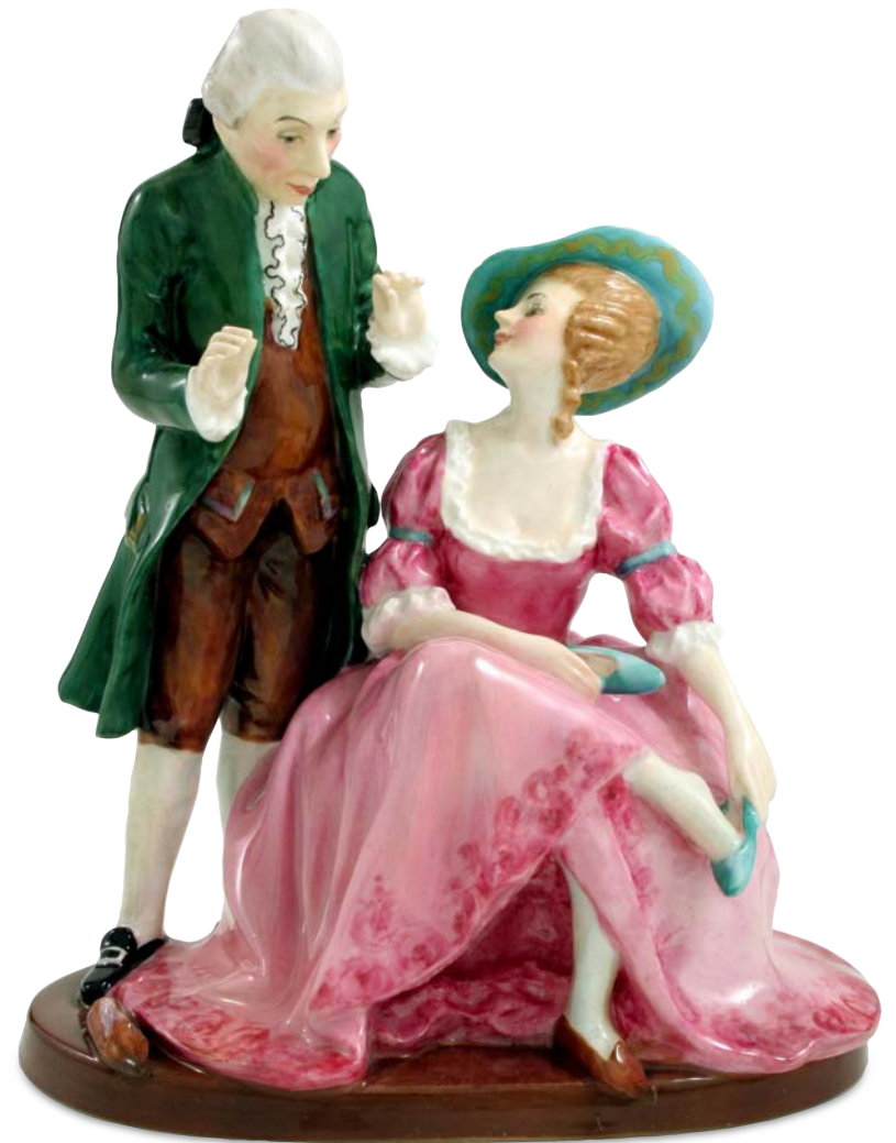
Court Shoemaker HN1755 6.75"H $1,500