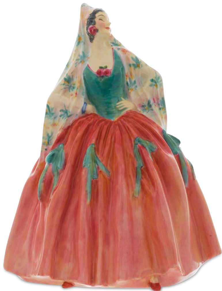
Modena HN1846 c.1938 7.25"H $2,000