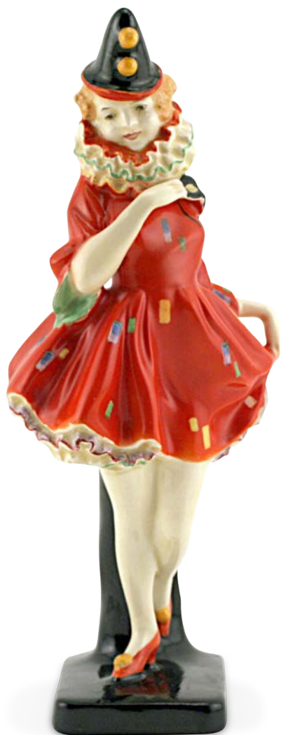
Pierrette HN1391 (Earthenware) 8.5"H $2,500

"Pierrette" is a Royal Doulton figure, designed by Leslie Harradine. Modeled as a mischievous Pierrette ( a female "Pierrot," or sad clown). A Pierrot (French for "Little Peter") is a character from Commedia dell'Arte, with the personality of a sad clown in love.