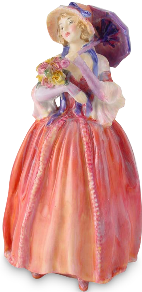
June HN1947 7.25"H $1,000