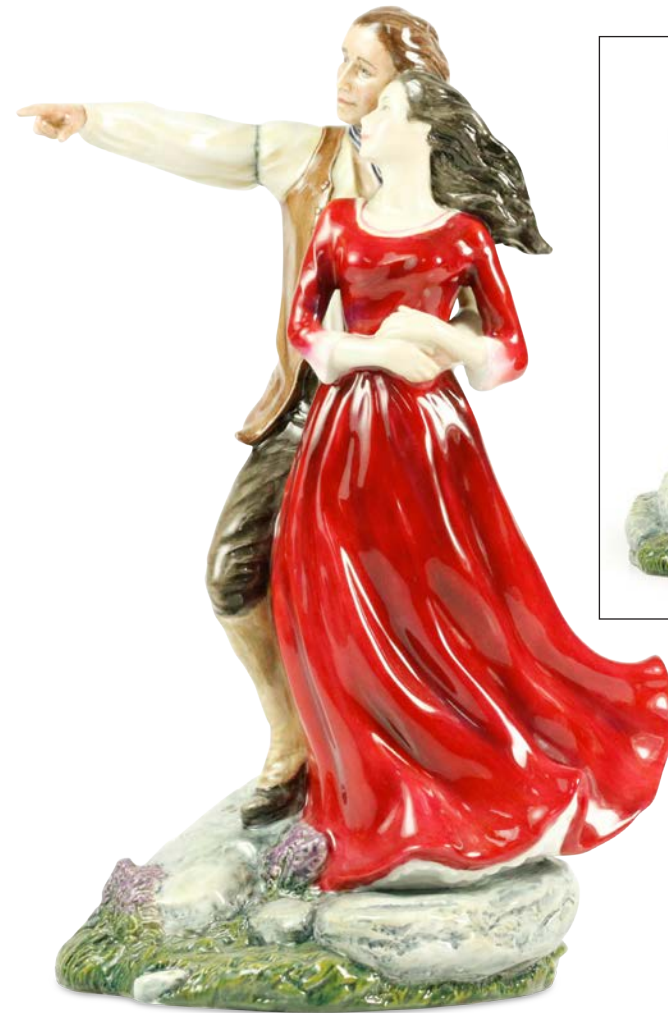
Heathcliff and Cathy (Colorway) 13"H $3,200

"Sir Walter Raleigh" is a very rare historical figure designed by Leslie Harradine and issued from 1935 to 1949. Decorated in a rich green, purple and orange colorway, it is modeled as the proud royal favorite of Queen Elizabeth I. Raleigh sailed to America in 1584, returning with cotton, potatoes, and tobacco, none of which had been seen in Europe.