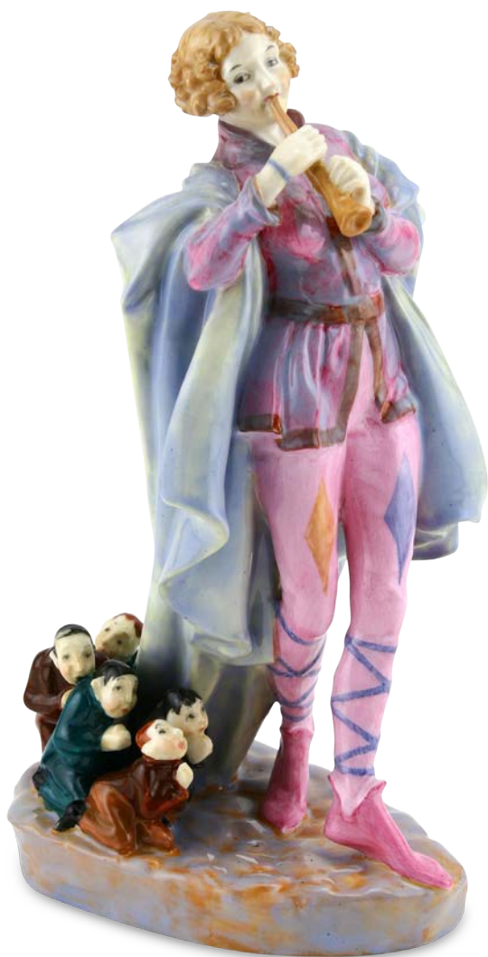
Modern Piper HN756 8.5"H $2,500

"Modern Piper" is a Royal Doulton figure designed by Leslie Harradine, and issued from 1925 to 1938. Painted in a blue, purple and lilac colorway, it depicts a young female Pied Piper, leading the village men away. It probably was inspired by a contemporary revue of the traditional story.