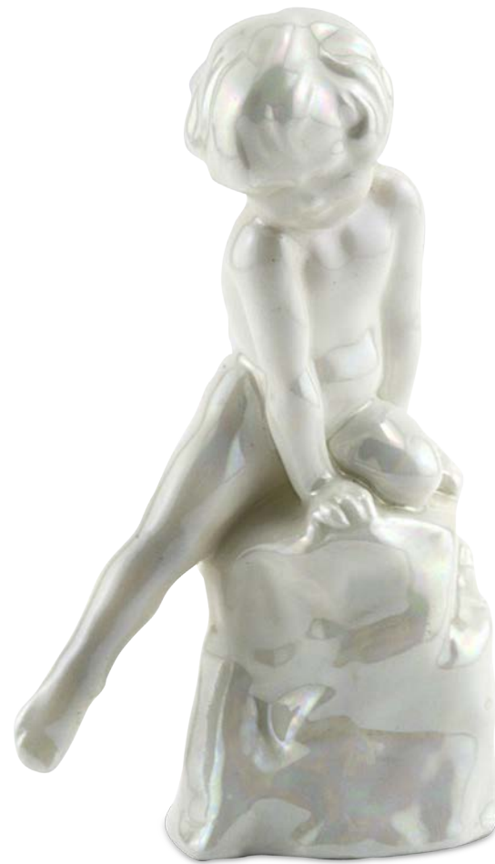
Saucy Nymph Lustre Glaze 4.5"H $750

"Fairy" is a Royal Doulton figure produced from 1932 to 1938. It is modeled as a fairy child sitting on a colorful mushroom amidst the flowers, painted in a yellow, purple, blue and green colorway.