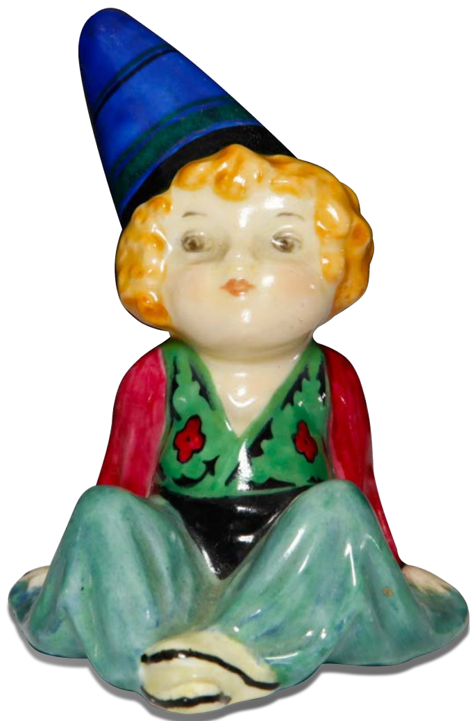
Cassim (Colorway) 3"H $3,000

"Cassim" is a Royal Doulton figure, designed by Leslie Harradine. It is modeled as a young boy wearing trousers, shirt and waistcoat with pointed hat.