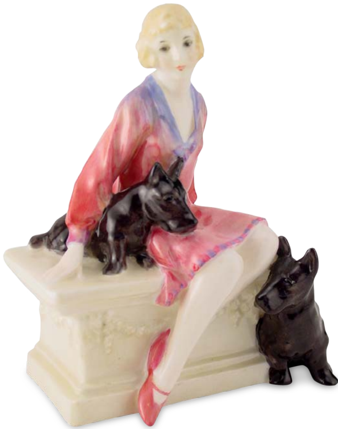
Scotties HN1281 5.5"H $2,500

A Royal Doulton Art Deco figure designed by Leslie Harradine, and issued from 1928 to 1938, "Scotties" depicts a woman, sitting on a bench with her two black Scottish terriers. Splendidly hand painted in a pink colorway, the figure was produced in an era when Scotties were a popular fashion accessory.