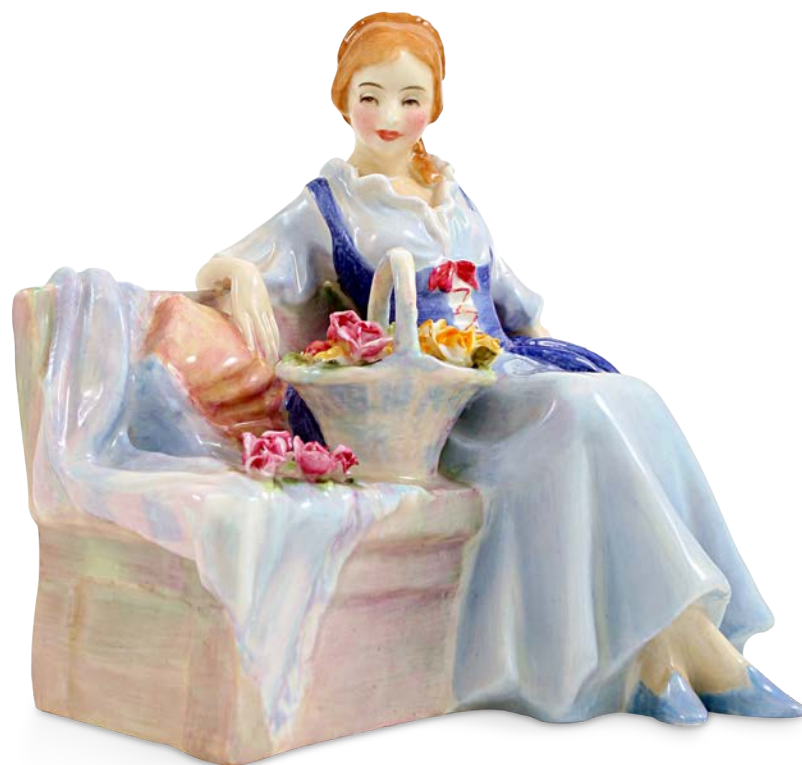
Midsummer Noon HN1900 4.75"H $1,500