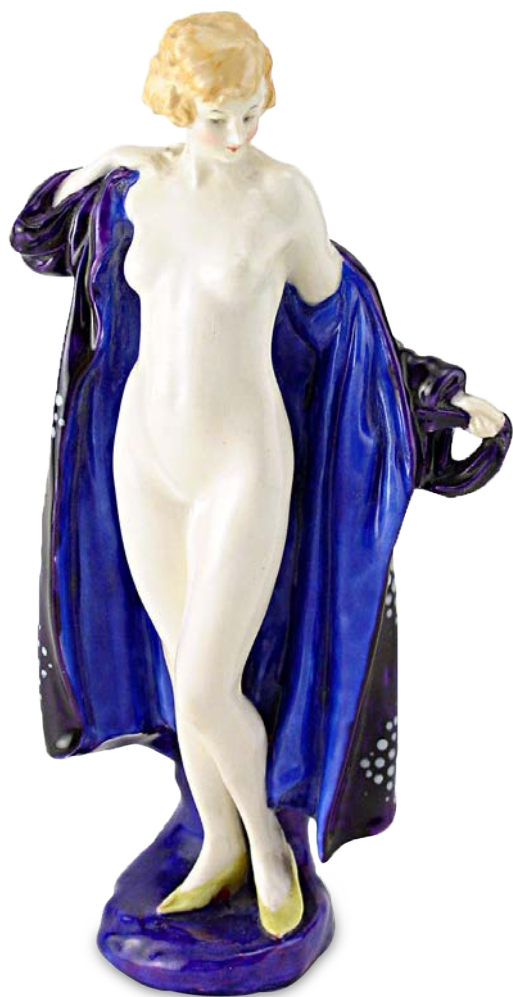
The Bather HN687 7.75"H $1,500

"The Bather" is a Royal Doulton Art Deco figure designed by Leslie Harradine, introduced in 1935 and withdrawn by 1924. Painted in shades of blue, it is modeled as a young woman putting on robe. Because of changes in popular tastes, this version was later produced decorated with a bathing suit.