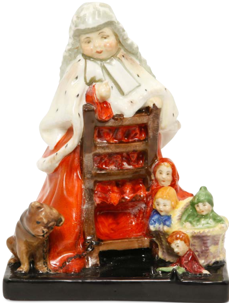
Judge and Jury HN1264 6"H $18,500

"Judge and Jury" is a Royal Doulton figure designed by J.G. Hughes, and produced from 1927 to 1938. This delightful figure is modeled as a child wearing the wig and ermine robes of a British judge, passing sentence on his puppy "defendant," before a "jury" of dolls in a basket.