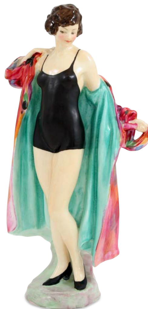
The Bather HN1708 7.75"H $6,500