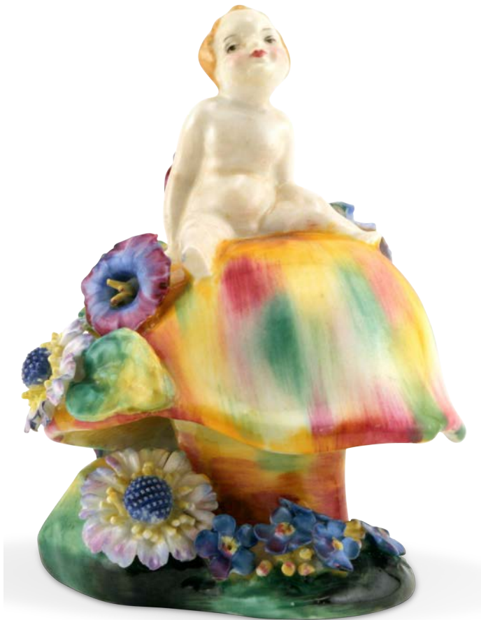
Fairy HN1532 4"H $3,750

"Fairy" is a Royal Doulton figure produced from 1932 to 1938. It is modeled as a fairy child sitting on a colorful mushroom amidst the flowers, painted in a yellow, purple, blue and green colorway.