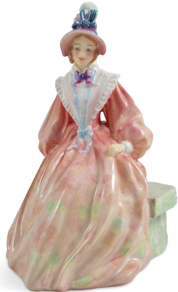
Meriel HN1931 7.25"H $1,200