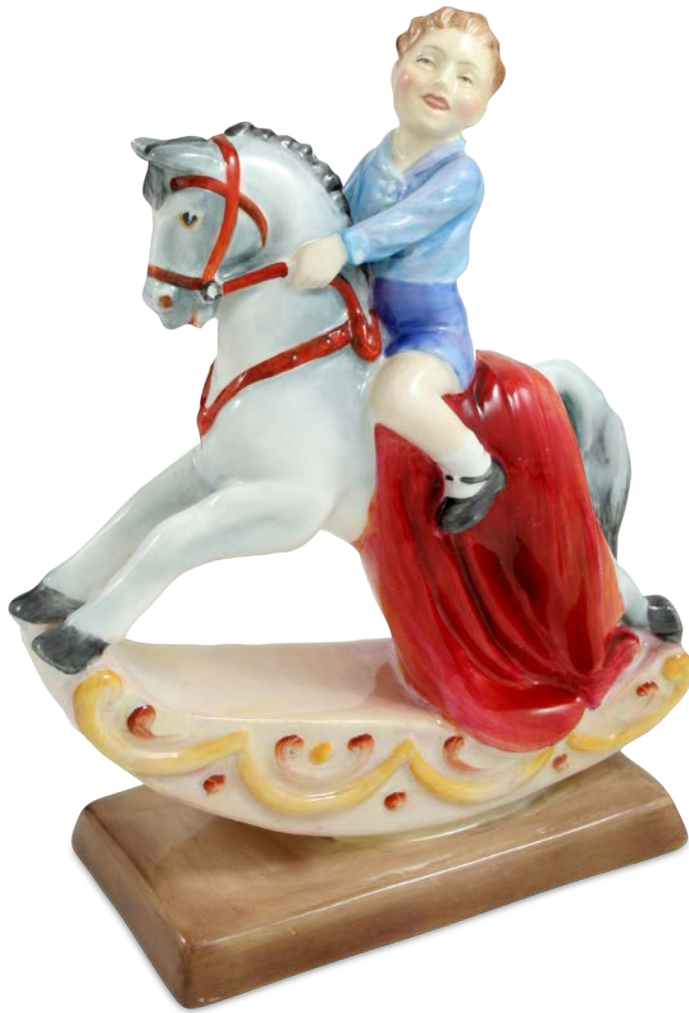
The Rocking Horse HN2072