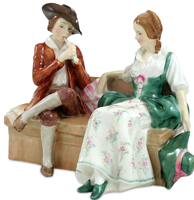
Rustic Swain HN1745 5.25"H $3,250