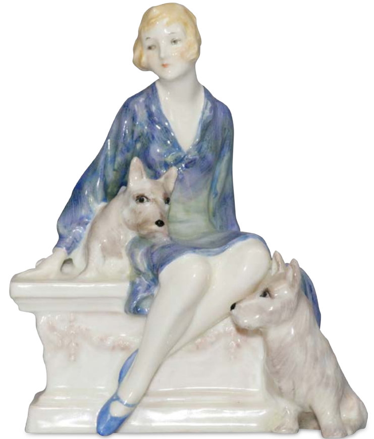
Scotties HN1349 5.25"H $5,000