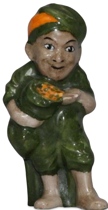
One of the Forty HN423F 2.75"H $2,000

"One of the Forty" is a miniature Royal Doulton figure designed by Harry Tittensor, and issued from 1921 to 1938. Painted in an olive, green and yellow colorway. It is modeled as one of the Forty Thieves dressed in a turban, with his hands holding a bag of treasure. "Ali Baba and The Forty Thieves" was a traditional oriental tale adapted for the operetta "Chu Chin Chow," first performed in 1916.