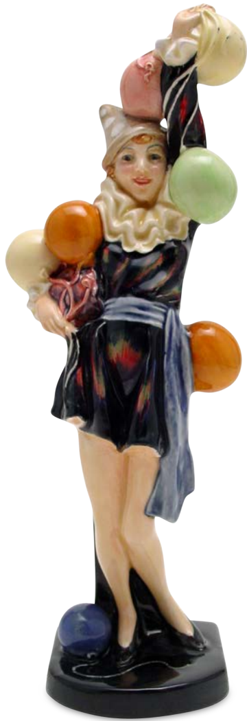
Folly HN1750 9.5"H $3,000

"Folly" is a Royal Doulton figure, designed by Leslie Harradine, in production from 1936 to 1949. Modeled as a mischievous Pierrette (a female "Pierrot," or sad clown), carrying balloons and wearing a cone hat, ruffled collar and short dress.