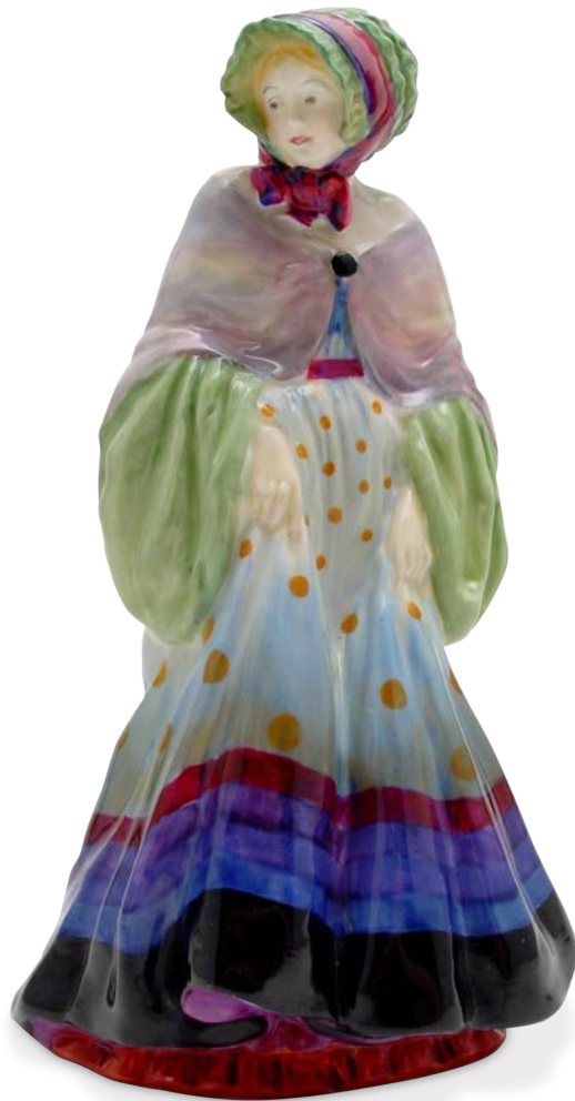
Parson's Daughter HN1356 9.25"H $1,000