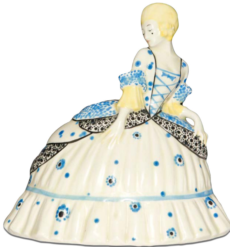
Puff and Powder HN400 6.5"H $4,000

"The Boquet" (also called "The Nosegay") is a Royal Doulton figure designed by Leslie Harradine and issued from 1926 to 1938. Decorated in a blue colorway it depicts a lady wearing a dress and shawl, admiring a bouquet of colorful flowers.