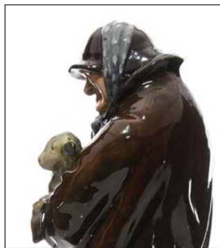
A Shepherd HN81 13.25"H $26,500

"A Shepherd" is a Royal Doulton figure designed by Charles Noke, circa 1918. It is modeled as a shepherd wearing a dark brown glazed cap and smock, supporting a lamb in one hand and a lantern in the other.