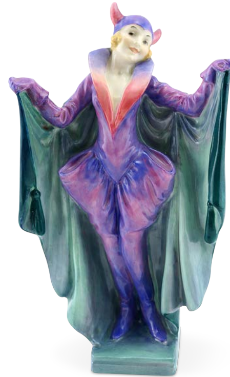
Marietta HN1446 c.1931 8"H $1,500

"Marietta" is a Royal Doulton Art Deco figure produced between 1929 and 1938. Designed by Leslie Harradine, it is modeled as Marietta, the heroine of the 19th century comic operetta, Die Fledermaus, dressed in a striking bat costume.