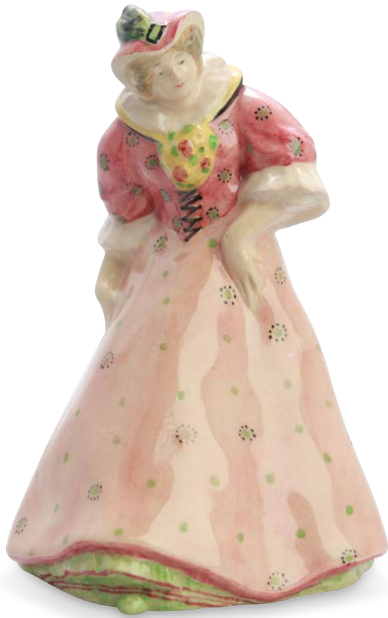
Katherine HN615 5.75"H $2,000

"Katherine" (also spelled "Katharine") is a Royal Doulton figure designed by Charles Noke and issued from 1924 to 1938. It is modeled as a court lady wearing the fashion of 16th century Elizabethan England, and painted in a striking and unusual red and green colorway.