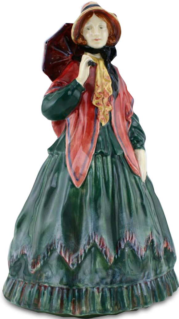
Clarissa HN1525 10"H $1,000

"Clarissa" is a Royal Doulton figure designed by Leslie Harradine, and issued from 1932 to 1938. It is modeled as strolling woman, holding a parasol.