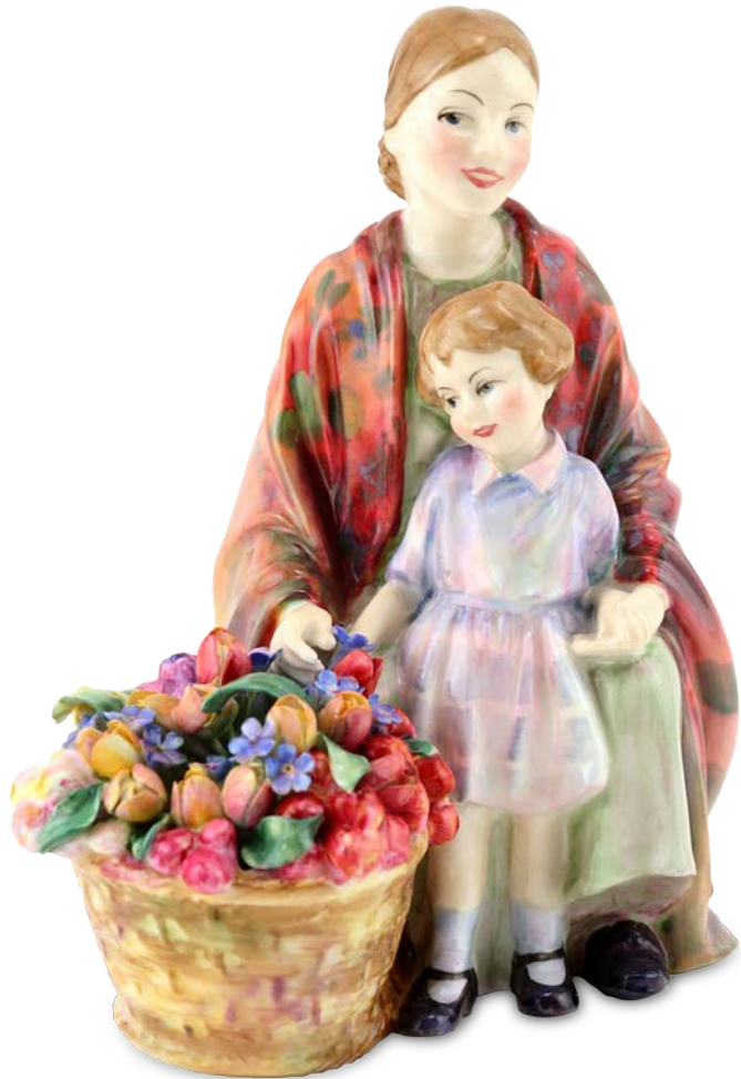
Blossom HN1667 6.75"H $2,500