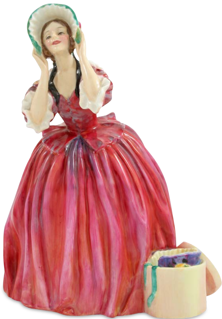
The Choice HN1959 c.1941 7.25"H $2,500