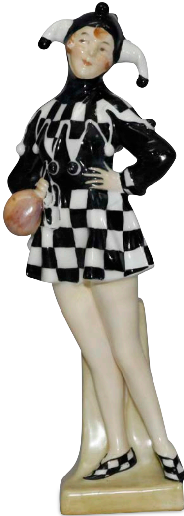
Lady Jester HN1222 7"H $5,000