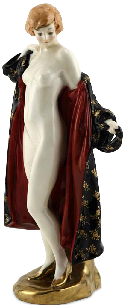
Bather HN1238 7.75"H $4,500