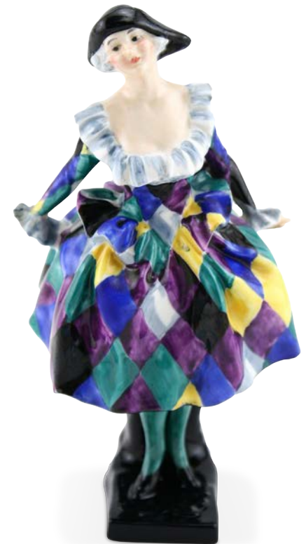
Harlequinade HN585 c.1923 6.5"H $3,000