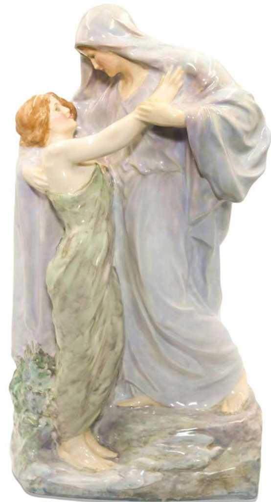
The Return of Persephone HN31 16"H $26,000

"The Return of Persephone" is a Charles Vyse pottery figure, a very rare early model produced in 1913 for Doulton Burslem, depicting the goddess Persephone returning to her mother, Demeter. In ancient times, the spring equinox marked the return of Persephone from the Underworld. Only two models of this figure are thought to have been produced.