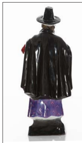
Myfanwy Jones HN39 (Colorway) 12"H $9,500

"Myfanwy Jones" (also recorded as "The Welsh Girl" is a Royal Doulton figure designed by Ernest W. Light, and issued from 1914 to 1936. Hand painted in a striking red, black and purple colorway, it is modeled as a young woman from Wales, dressed in traditional cloak, blouse, floral dress, and capotain, a tall stovepipe-style hat worn by women as part of the Welsh national costume.