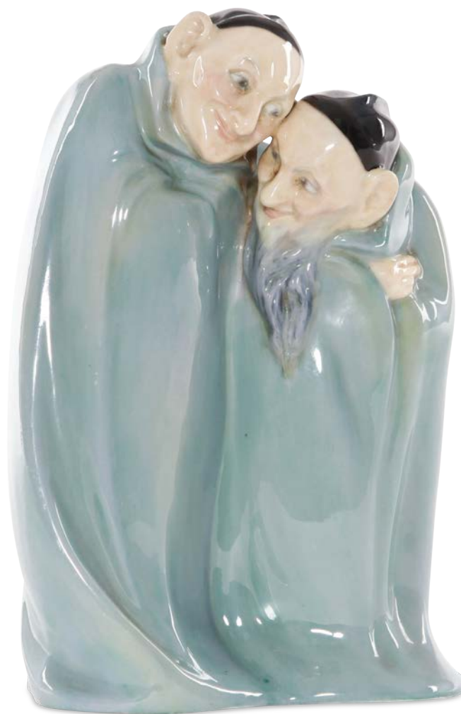
Spooks HN88 7.75"H $10,500

"One of the Forty" is a miniature Royal Doulton figure designed by Harry Tittensor, and issued from 1921 to 1938. Painted in an olive, green and yellow colorway. It is modeled as one of the Forty Thieves dressed in a turban, with his hands holding a bag of treasure. "Ali Baba and The Forty Thieves" was a traditional oriental tale adapted for the operetta "Chu Chin Chow," first performed in 1916.