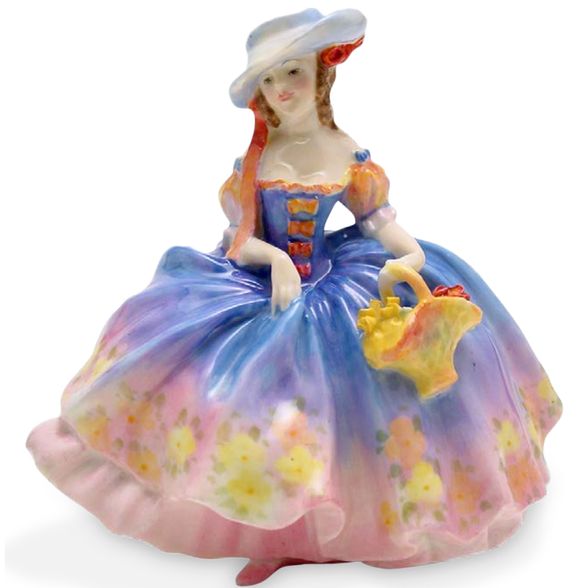
Margot HN1628 5.5"H $1,000