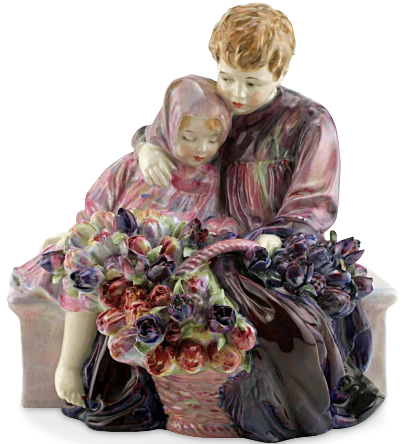
Flower Seller's Children HN1206 8.25"H $1,800