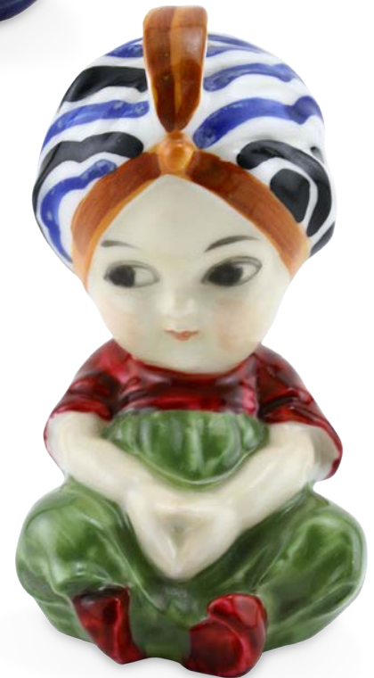
Boy with Turban HN587 c.1923 3.75"H $1,500