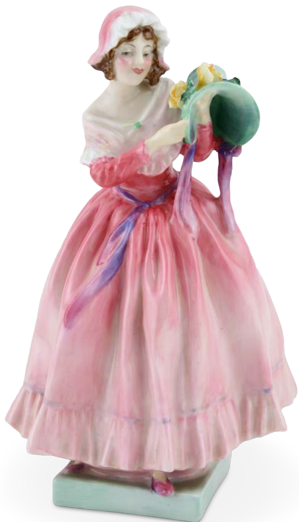
The New Bonnet HN1728 7"H $1,500

"The New Bonnet" is a Royal Doulton figure designed by Leslie Harradine, and issued from 1935 to 1949. Painted in a vibrant pink colorway, it is modeled as a young woman dressmaker, holding a spectacular spring bonnet with flowers.