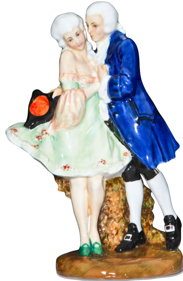
Perfect Pair HN581 (Colorway) 6.75"H $2,000

"Pantalettes" is a Royal Doulton figure designed by Leslie Harradine, and issued from 1930 to 1949. Painted in a spectacular pink, blue and green colorway, she wears a bonnet decorated with flowers. The exquisite details include layers of petticoats, and her puffy pantalettes ruffled at the ankles.