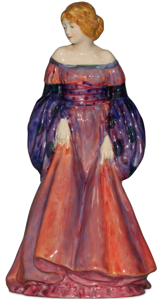
Pretty Lady HN565 9.5"H $4,250

"Pretty Lady" is a Royal Doulton figure designed by Harry Tittensor, and issued from 1916 to 1938. This is a gorgeous color variation, hand painted in a lustrous grey colorway and modeled as a young woman wearing a spectacular gown, and a circlet on her head.