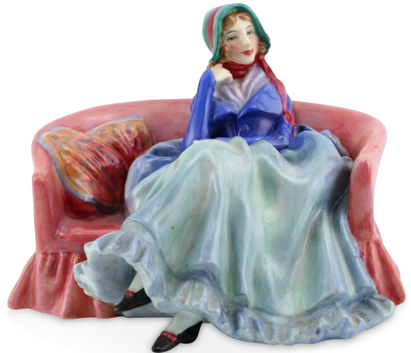
Reflections HN1848 5"H $1,200

A beautiful Royal Doulton figure, "Quality Street" is modeled as a woman wearing a stylish dress and ladies bonnet, and decorated in a red colorway. Although record of the designer remains unknown, the figure was issued from 1926 to 1936.