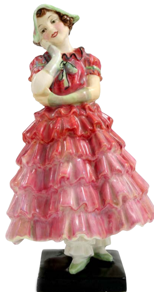
Maisie HN1619 6.25"H $825