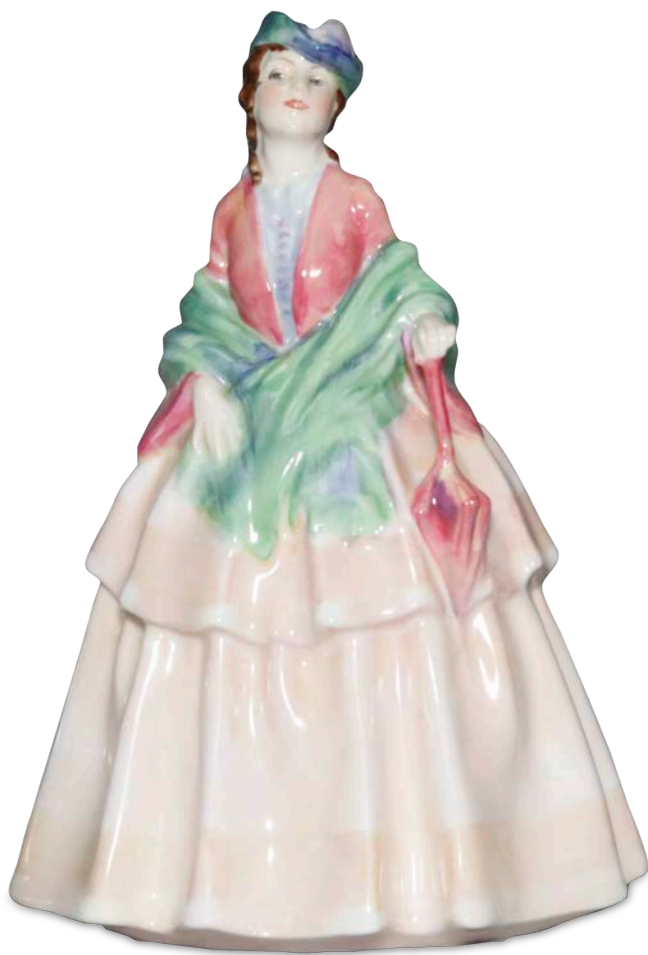
Anthea HN1669 6.5"H $900