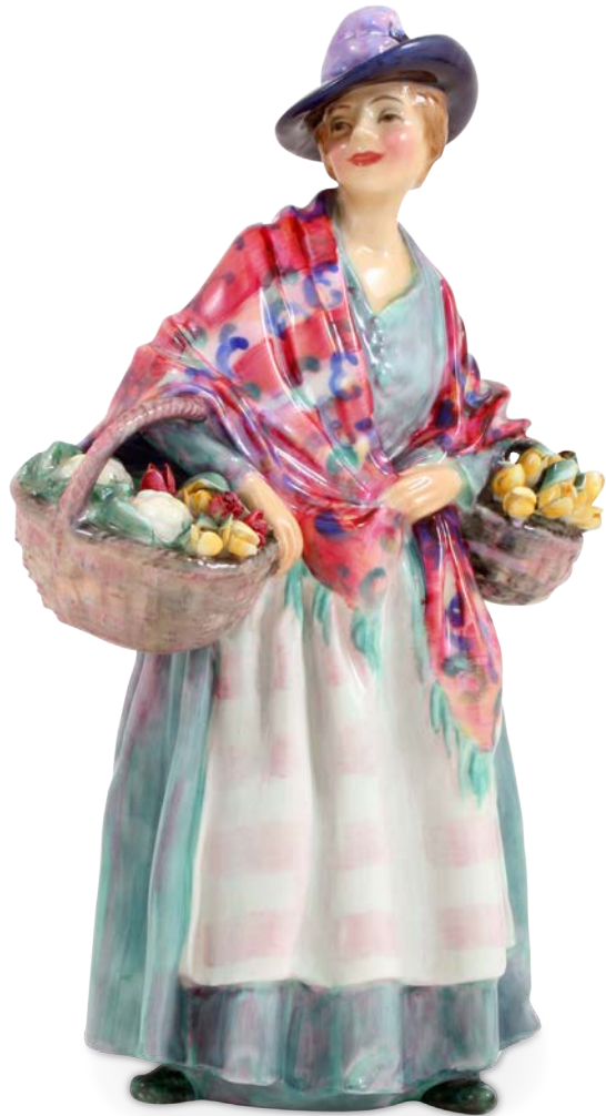
Romany Sue HN1757 9.75"H $2,250