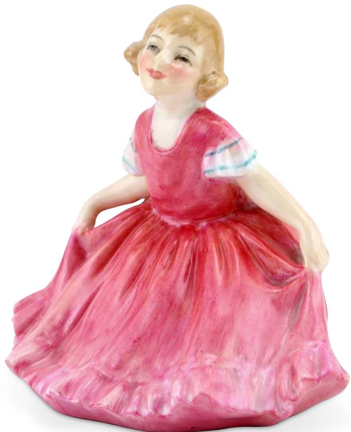
Daisy HN1961 3.5"H $800

"Daisy" is a Royal Doulton figure, designed by Leslie Harradine, and produced from 1941 to 1949. It depicts a curtsying young girl wearing a dress with frilly sleeves.