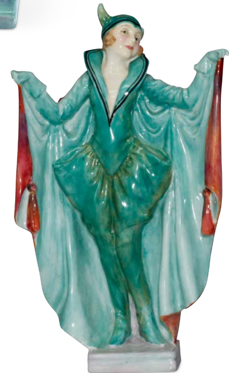
Marietta HN1699 c.1935 8"H $2,500