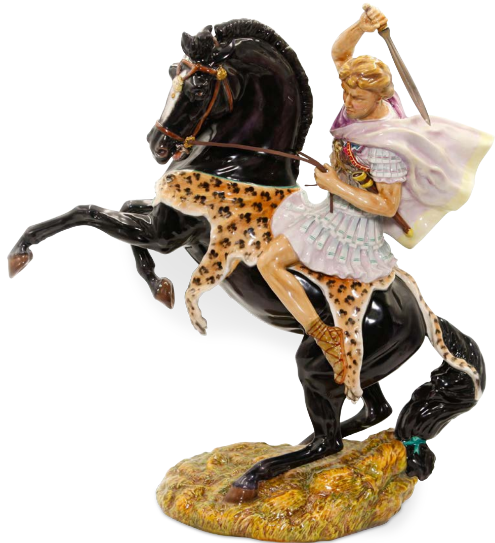
Alexander the Great HN4481 18"H $32,000

We invite you to explore our catalog and find the next great piece of Royal Doulton to add to your collection. Whether it be a piece from the Royal Doulton archives, a Prestige Figure, a Prototype, a rare Pretty Lady, a fantastic Character Figure or a precocious Child Study, we know that whatever you choose will bring you endless pride and joy.