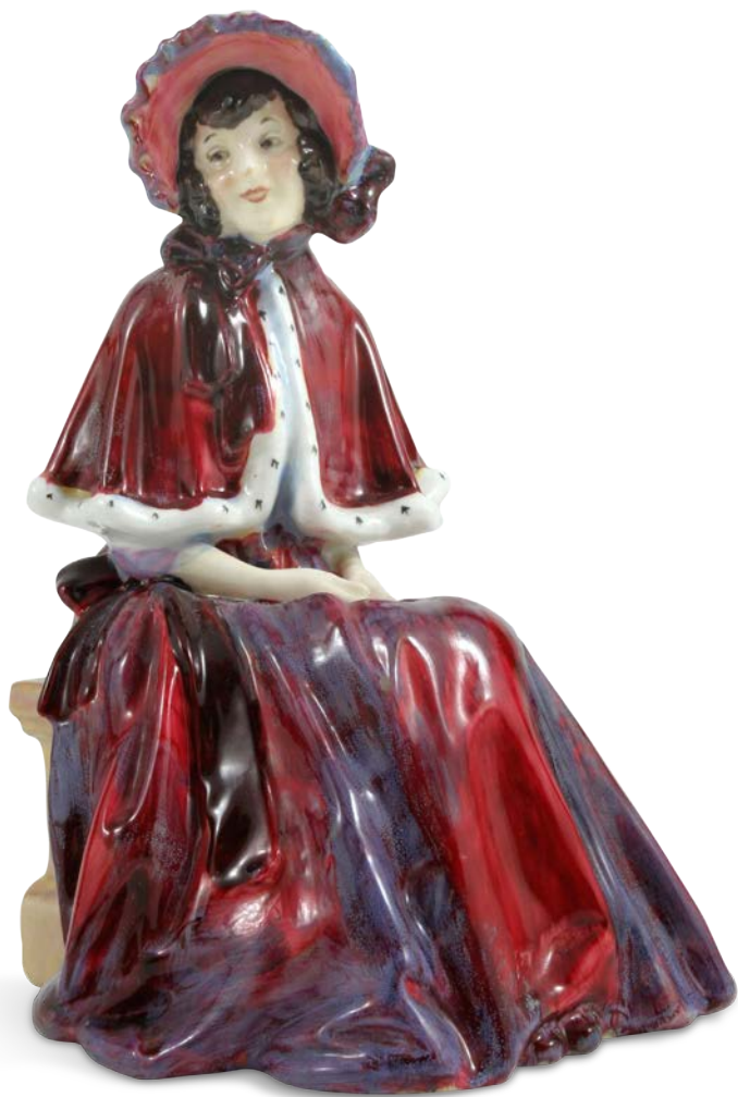
Rosina HN1358 5.75"H $1,000