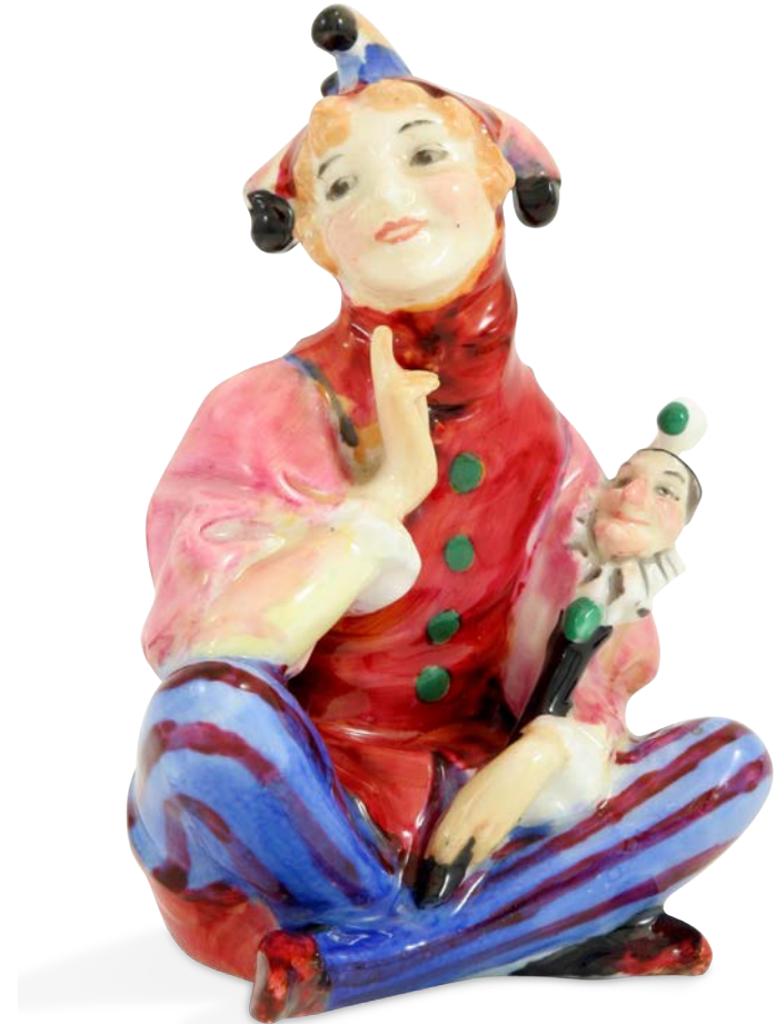
Lady Jester HN1285 4.25"H $5,000