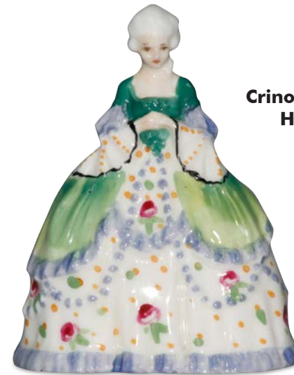
Crinoline Lady HN650

"The Parson's Daughter" is a very early figure by Royal Doulton, designed by Harry Tittensor and manufactured from 1929 until 1938. Painted in multiple vibrant colors, it may have been inspired by a similarly titled painting by British artist George Romney (1734-1802).