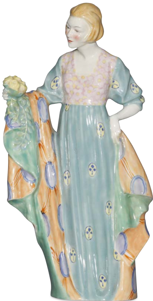
The Boquet HN406 9.25"H $6,250

"The Boquet" (also called "The Nosegay") is a Royal Doulton figure designed by Leslie Harradine and issued from 1926 to 1938. Decorated in a blue colorway it depicts a lady wearing a dress and shawl, admiring a bouquet of colorful flowers.