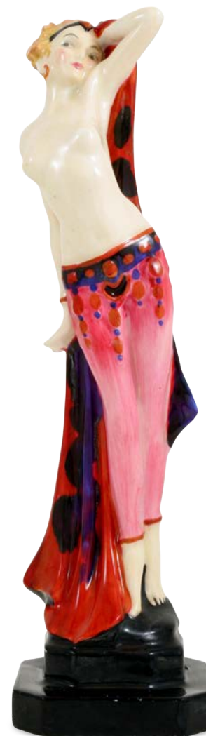
Carnival HN1260 8.25"H $10,000