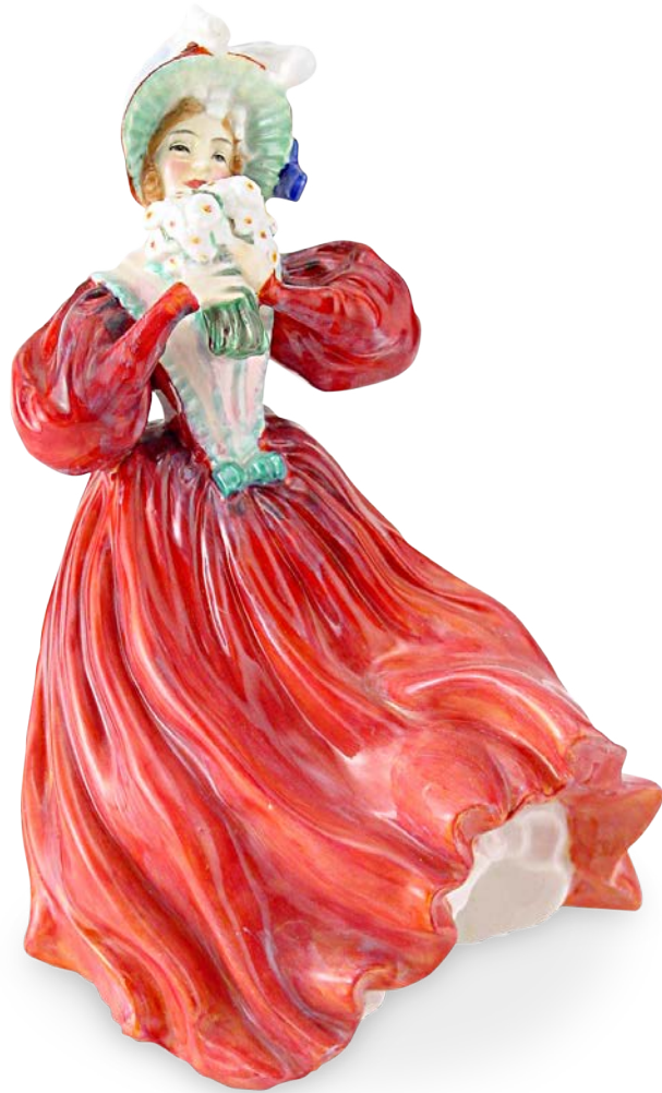
Marguerite HN1946 8"H $1,000

"Marguerite" is a Royal Doulton figure designed by Leslie Harradine, and issued from 1940 to 1949. Painted in a red, blue, and green colorway, it is modeled as a woman wearing a feathered bonnet and long dress, holding a bouquet of white flowers to her face. The figure was inspired by a calendar design entitled "Summer Breeze," by 20th century artist Stanislaus S. Longley.