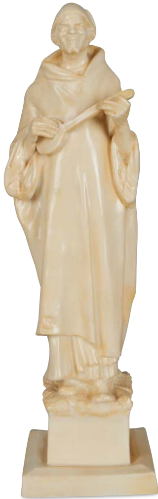
Moorish Minstrel in Vellum 13.5"H $8,500

"Moorish Minstrel in Vellum" is a Royal Doulton figure designed by Charles J. Noke. It is modeled as a musician dressed in period costume and playing a stringed instrument. Royal Doulton Vellum figures were first shown at the 1893 Chicago Exposition. Inspiration for the figures often came from popular theater motifs.