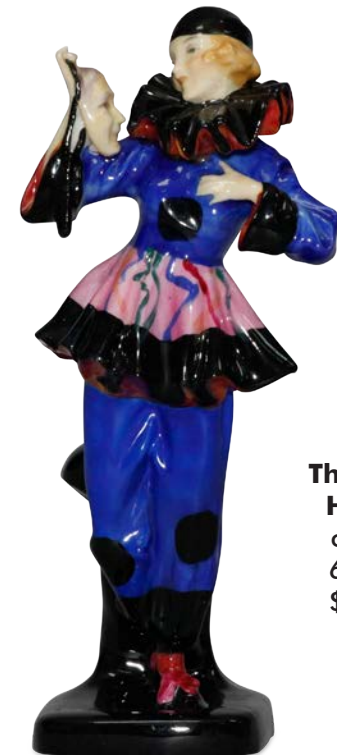
The Mask HN785 c.1926 6.75"H $5,500