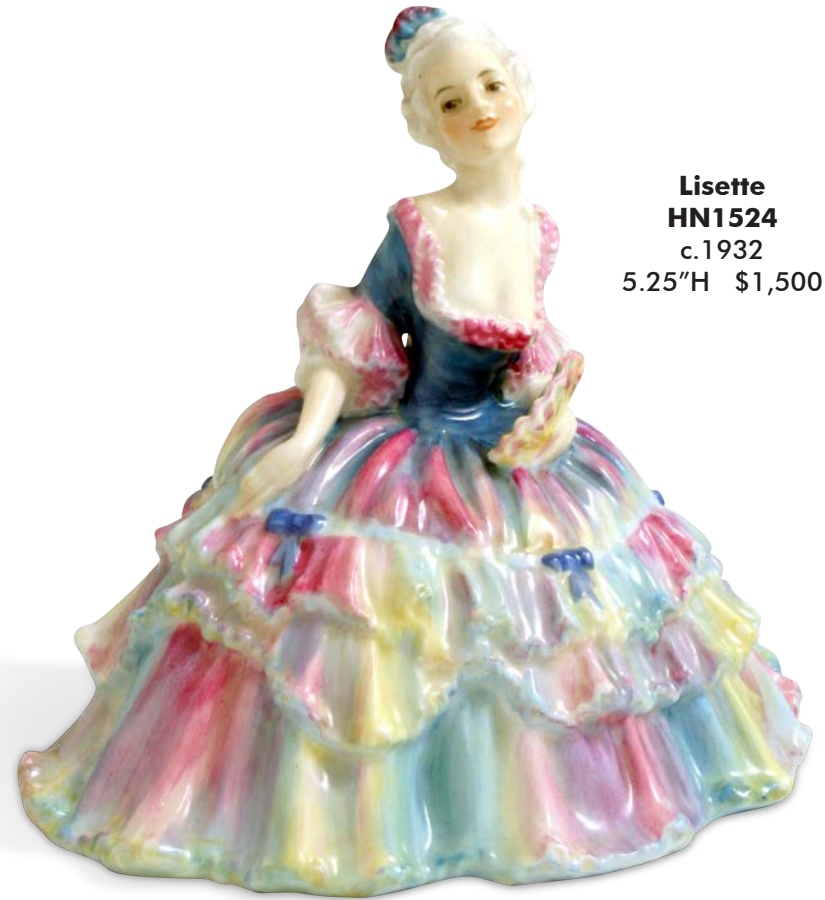
Lisette HN1524 c.1932 5.25"H $1,500