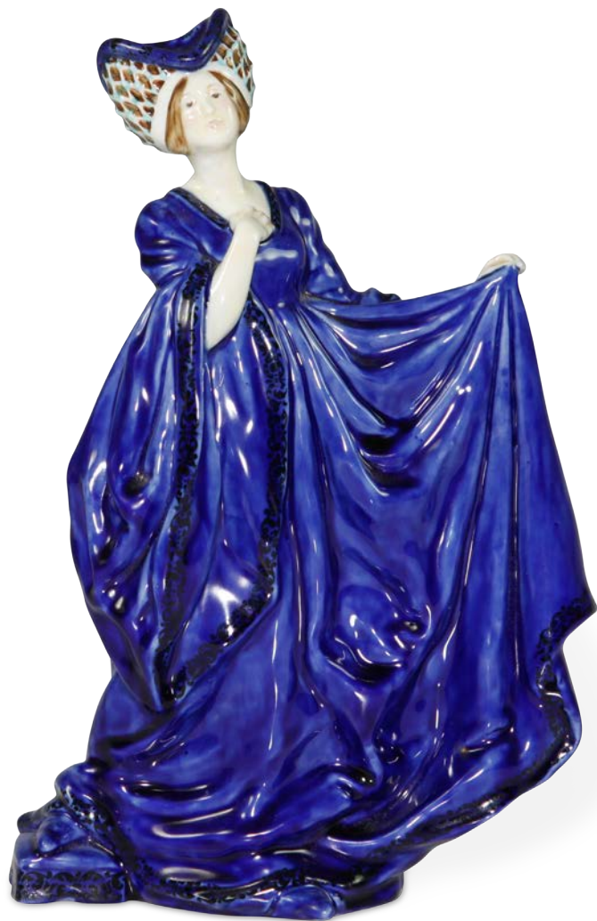
The Lady Anne HN93 9.5"H $15,000

"The Lady Anne" is a Royal Doulton figure designed by Ernest W. Light and issued from 1918 to 1938. It is modeled as a court lady dressed in a gown and head crespine of 15th century Lancastrian England, and painted in a striking blue colorway.