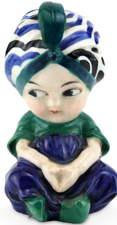
Boy with Turban HN586 c.1923 3.75"H $2,250