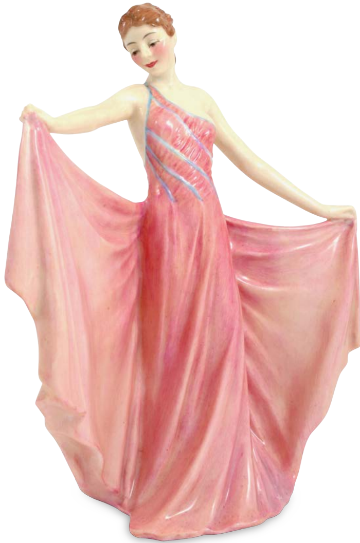
Rhythm HN1903 6.75"H $3,500