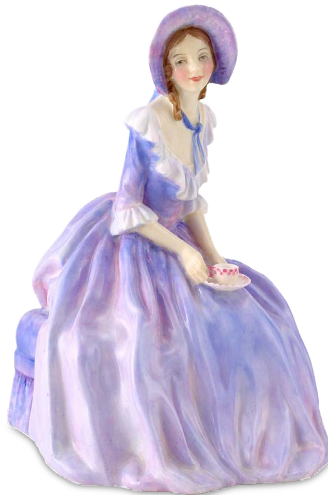
4 O'clock HN1760 6"H $1,800