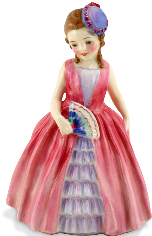
Nana HN1766 4.75"H $525