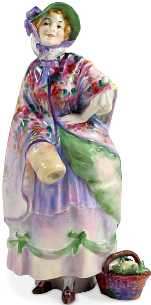
Dolly Vardon HN1515 8.5"H $1,000

"Dolly Vardon" is a Royal Doulton figure designed by Leslie Harradine and produced from 1932 to 1949. Hand painted and decorated in a red and lavender colorway, the figure was inspired by a character in the Charles Dickens novel Barnaby Rudge .