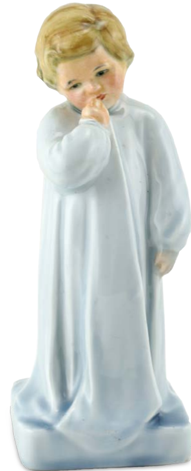
Darling HN1 7.75"H $3,500

"Dunce" is an early Royal Doulton figure designed by Charles Noke and produced from 1913 to 1936. Noke modeled several child studies which were decorated in pastel colors. Only 3 are known to exist.