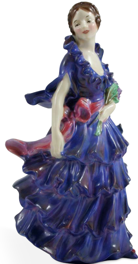
Pamela HN1468 7.5"H $1,800

"June" is a Royal Doulton figure designed by Leslie Harradine and issued from 1940 to 1949. It is modeled as a young woman dressed in a colorful, elegant dress, wearing a spring bonnet and holding a parasol.