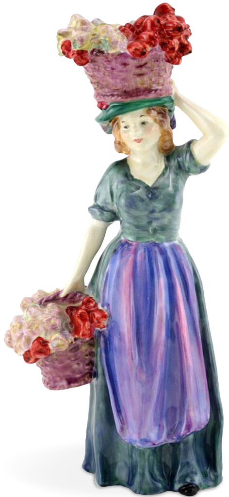
Covent Garden HN1339 9"H $2,500

"Covent Garden" is a Royal Doulton figure designed by Leslie Harradine and was issued from 1929 to 1938. Painted in a green and lavender colorway, it depicts a young woman wearing a hat, long skirt and apron holding a large basket of colorful flowers in one hand while balancing another on her head.