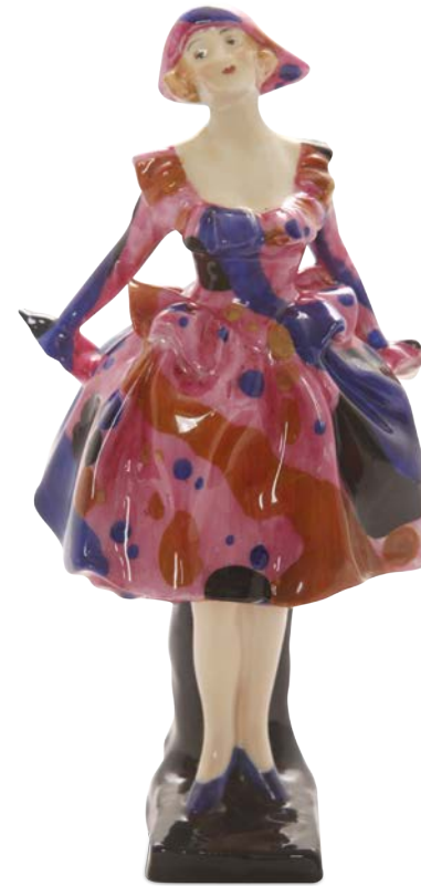
Harlequinade HN780 c.1926 6.5"H $5,000

"Harlequinade" is a Royal Doulton figure designed by Leslie Harradine, inspired by the British comic theatrical genre called Harlequinade.