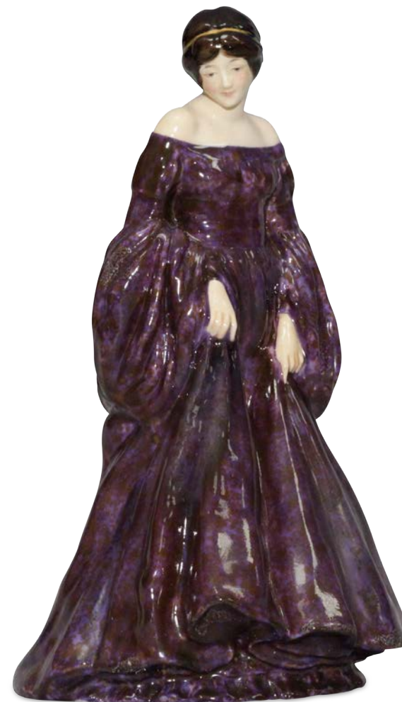
Pretty Lady HN302 9.5"H $1,800

"The Lady Anne" is a Royal Doulton figure designed by Ernest W. Light and issued from 1918 to 1938. It is modeled as a court lady dressed in a gown and head crespine of 15th century Lancastrian England, and painted in a striking blue colorway.