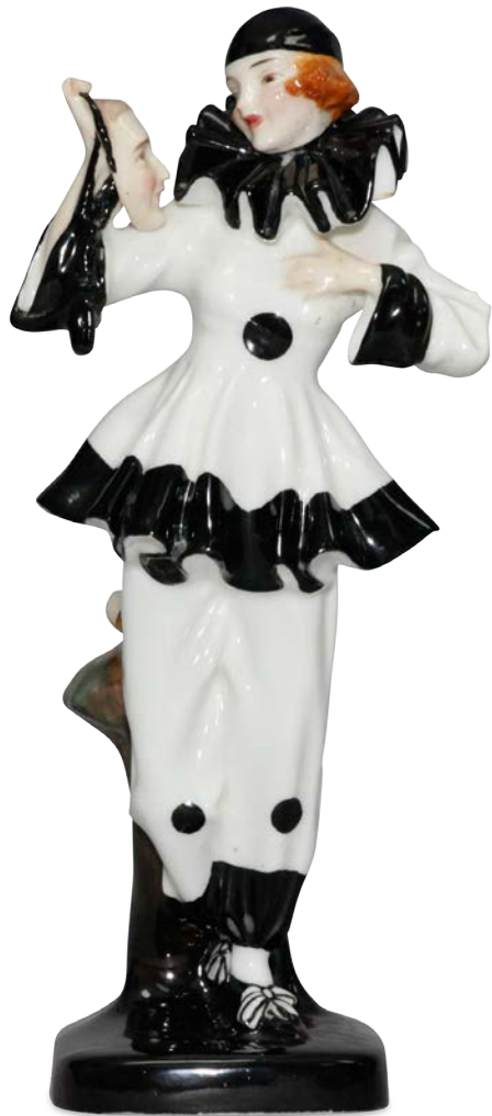
The Mask HN657 c.1924 7"H $5,000

"The Mask" is a Royal Doulton Art Deco figure designed by Leslie Harradine, inspired by the Italian Commedia dell'Arte. It depicts a female harlequin wearing traditional clown costume and head cap, holding a dress mask, and leaning against a pedestal, concealing a seated, winged cherub.