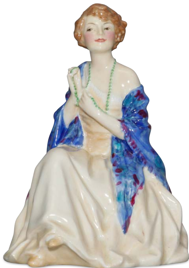
Aileen HN1803 6"H $1,500