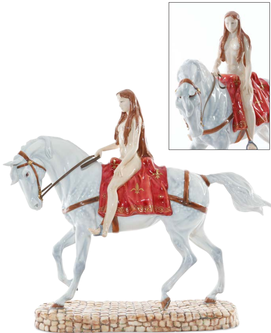
Lady Godiva HN4641 15.75"H $20,000