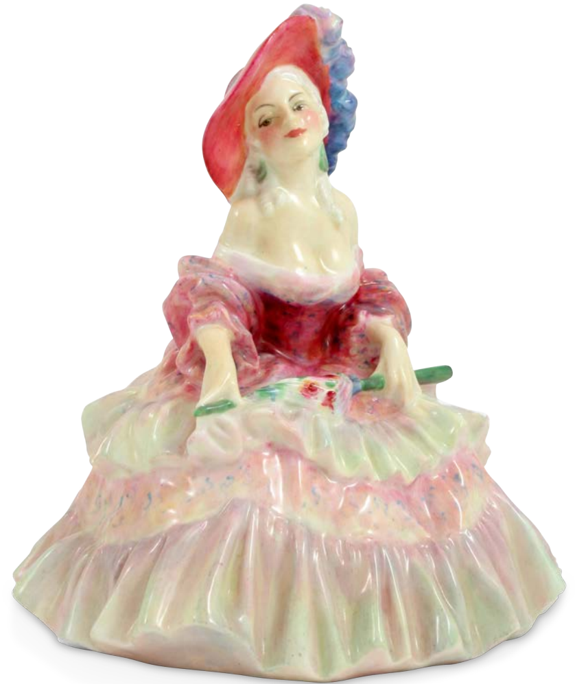
Evelyn HN1622 6.25"H $1,000