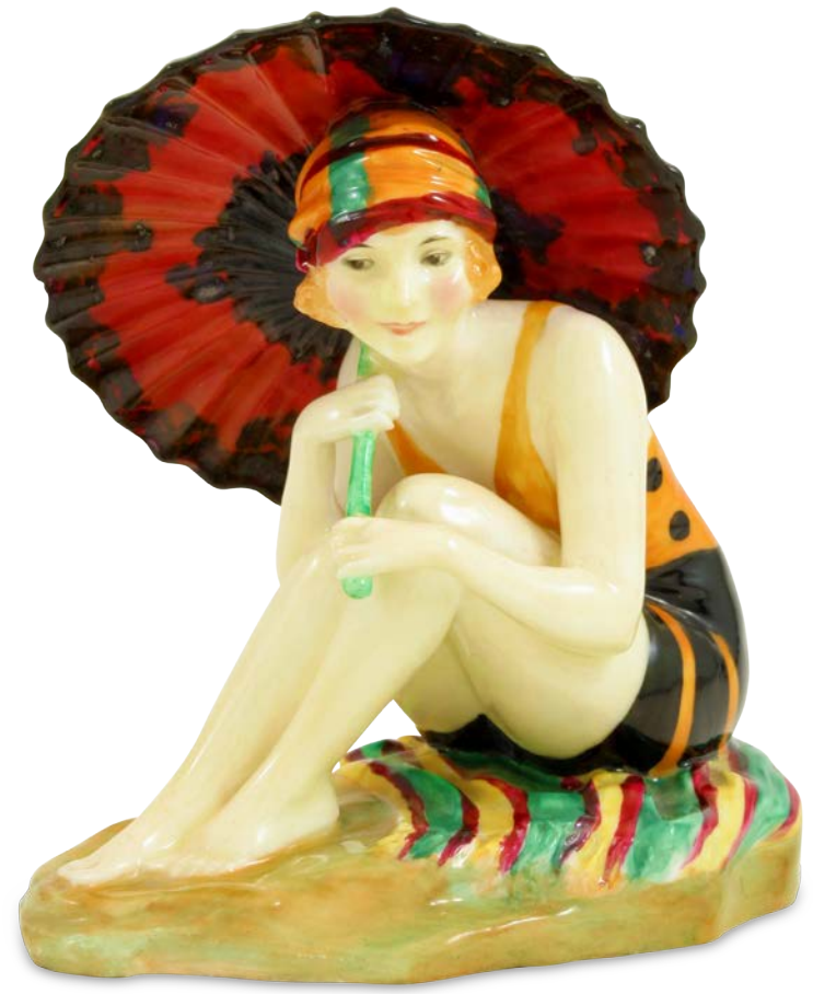
Sunshine Girl HN1348 5"H $9,500

"Sunshine Girl" is a Royal Doulton Art Deco figure designed by Leslie Harradine, inspired by ladies' swimsuit fashions of the era. Issued from 1929 to 1938, it depicts a young woman wearing a 1920s swim suit and bathing cap, and holding a parasol.