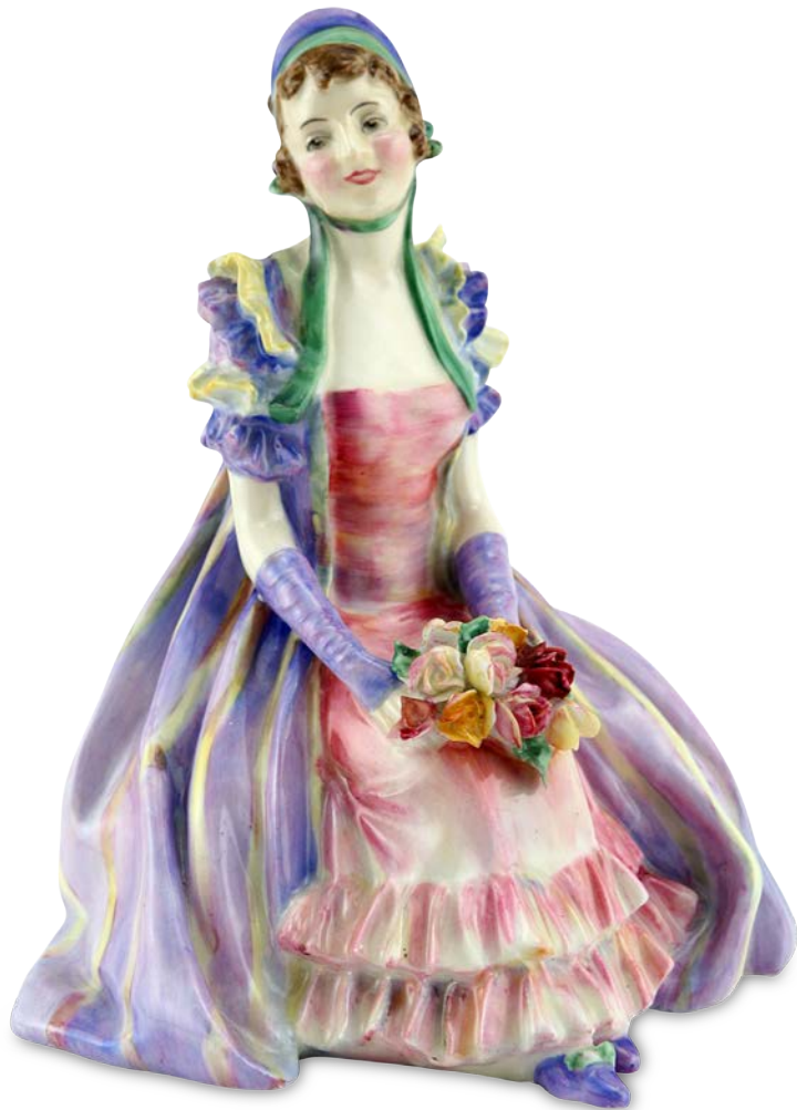
Cynthia HN1686 5.75"H $1,500