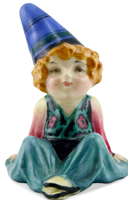
Cassim HN1231 c.1927 3"H $2,500

"Cassim" is a Royal Doulton figure, designed by Leslie Harradine. It is modeled as a young boy wearing trousers, shirt and waistcoat with pointed hat.