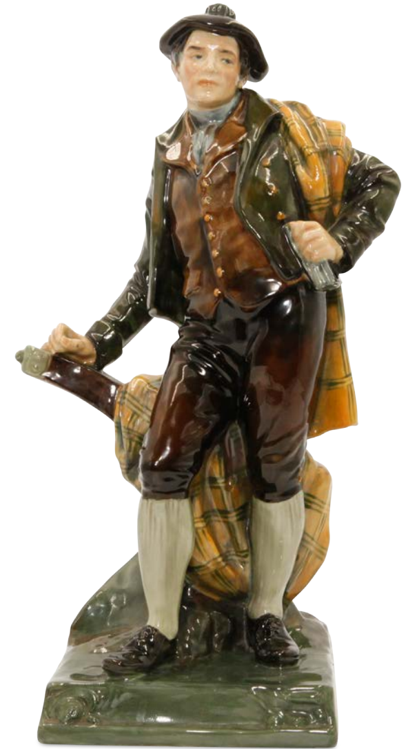
Robert Burns HN42 14"H $25,000

A Royal Doulton figure designed by Ernest W. Light, "Robert Burns" was produced from 1914 to 1938. It is modeled as Scotland's national poet (1759-1796), dressed in 18th century Highland garb and leaning on a plough. This figure continues a popular 19th century tradition of figures based on Burns.