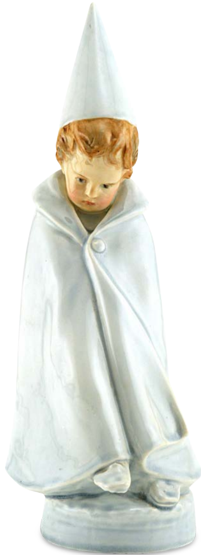
Dunce HN6 10.5"H $9,000

"Dunce" is an early Royal Doulton figure designed by Charles Noke and produced from 1913 to 1936. Noke modeled several child studies which were decorated in pastel colors. Only 3 are known to exist.