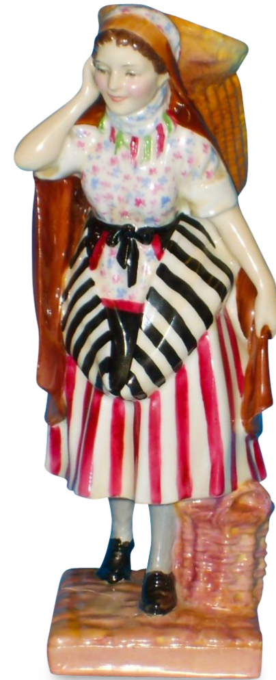
Newhaven Fishwife HN1480 7.75"H $5,500