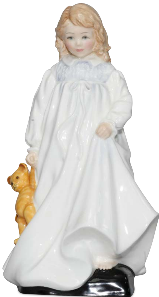
Young Girl in Nightgown Holding Teddy Bear (Prototype) 8.5"H $3,000

This Royal Doulton Prototype figure is a rare and unusual piece, only one or two being produced and decorated in different colorways.