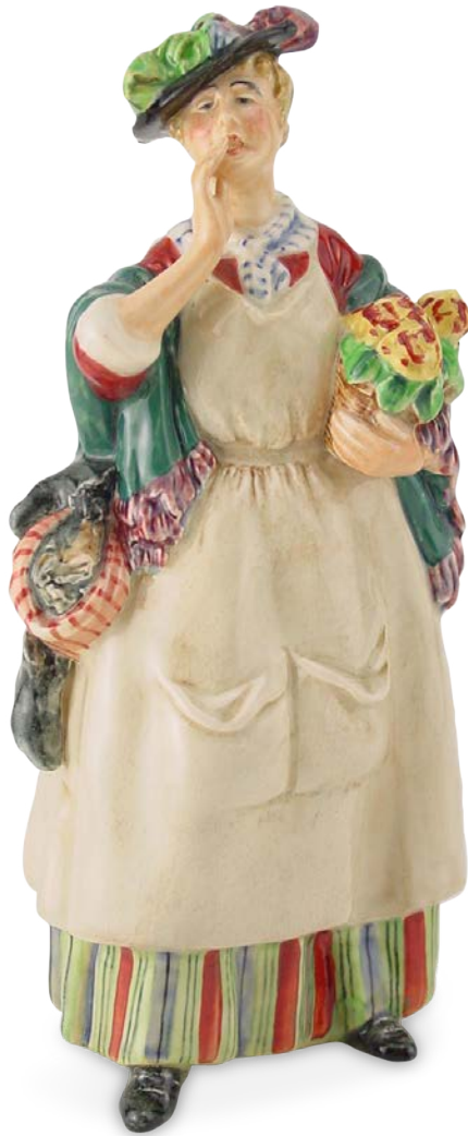
Odds and Ends HN1844 7.75"H $2,000