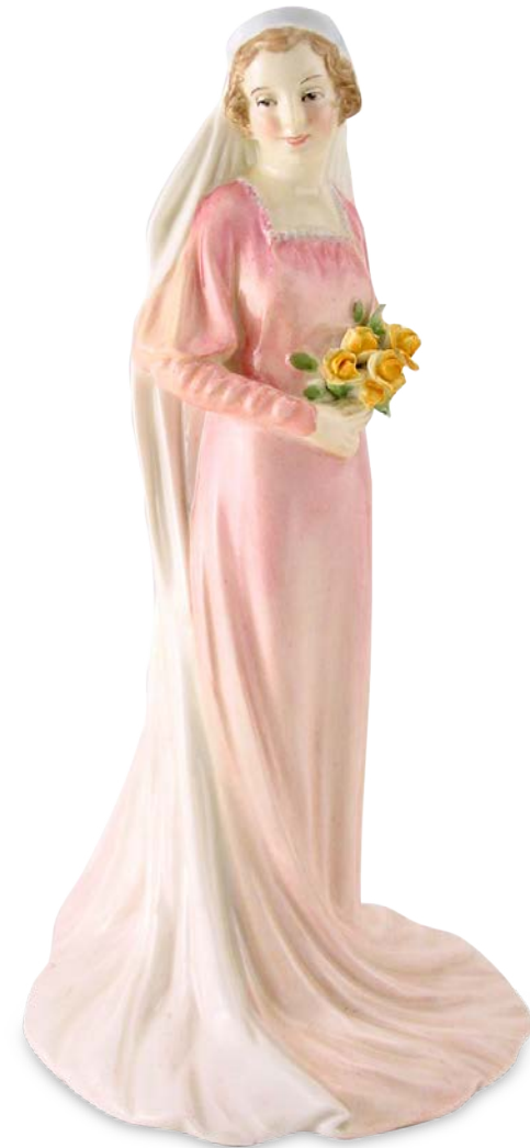
Bride HN1600 8.75"H $1,500