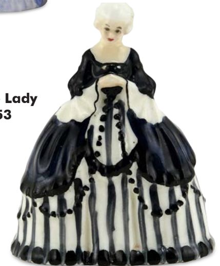
Crinoline Lady HN653