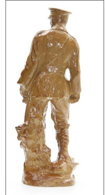
British Soldier Stoneware (Prototype) 7.5"H $3,500