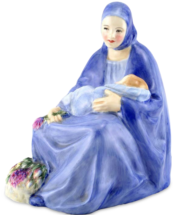
Madonna of the Square HN1969 7"H $1,000