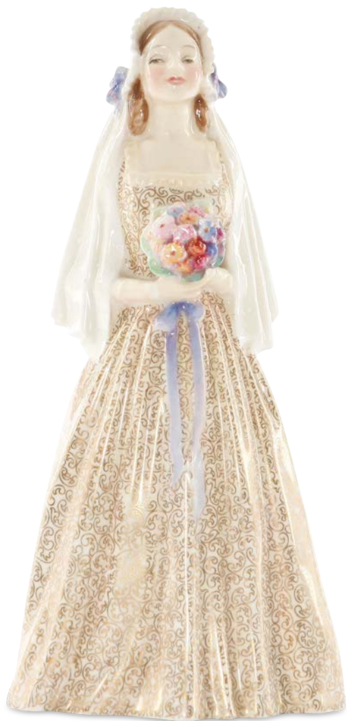
Sweet Maid (Colorway) 7.75"H $2,800

This beautiful variation of Royal Doulton's "Bride" figure, produced in 1951, is based on the model of "Sweet Maid" HN2092. This colorway variation has a detailed wedding dress in purple, white, and beige.