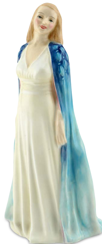
Collinette HN1998 6.25"H $750