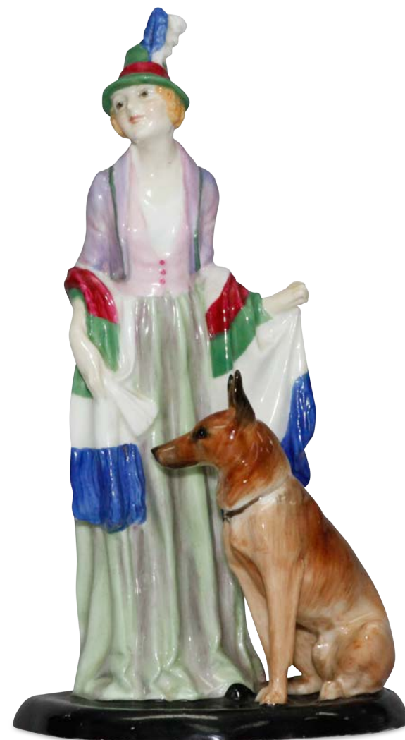
Rosamund with Dog (Unrecorded Variation) 7.25"H $8,500

"Modern Piper" is a Royal Doulton figure designed by Leslie Harradine, and issued from 1925 to 1938. Painted in a blue, purple and lilac colorway, it depicts a young female Pied Piper, leading the village men away. It probably was inspired by a contemporary revue of the traditional story.