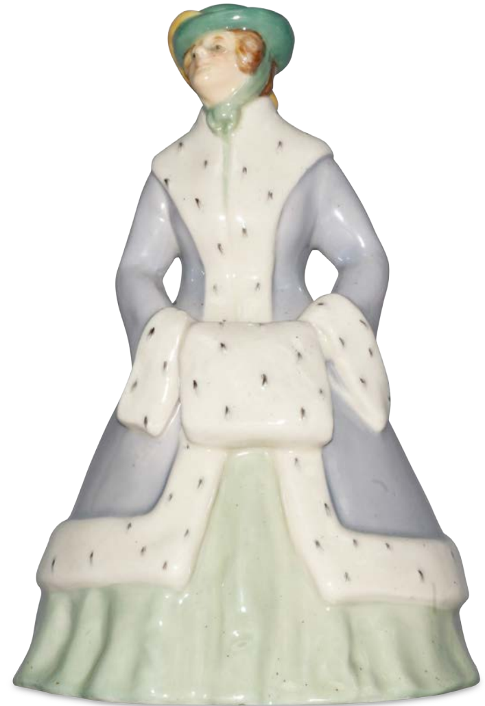
Ermine Muff HN54 8.25"H $3,000

"Clarissa" is a Royal Doulton figure designed by Leslie Harradine, and issued from 1932 to 1938. It is modeled as strolling woman, holding a parasol.