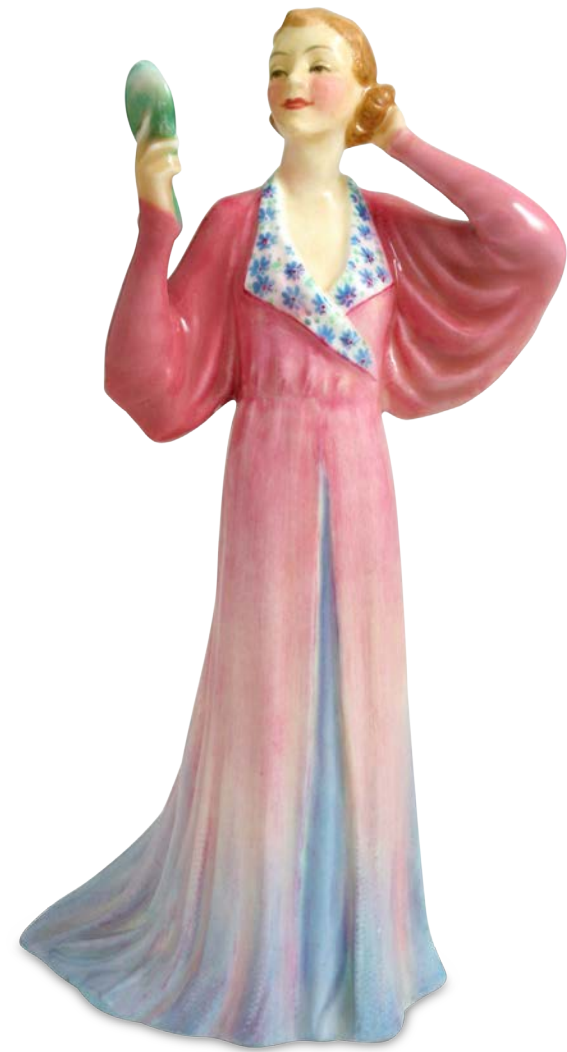
The Mirror HN1852 7.5"H $5,000

"Coming of Spring" is a Royal Doulton figure designed by Leslie Harradine. It was issued from 1935 to 1949, and depicts a young woman skipping through a flowered meadow with her arms upraised, holding a picnic blanket.