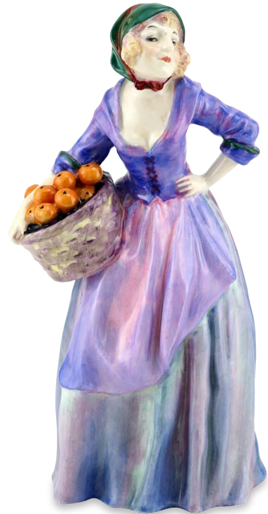
Orange Seller HN1325 7"H $1,000