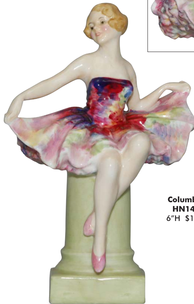
Columbine HN1439 6"H $1,500