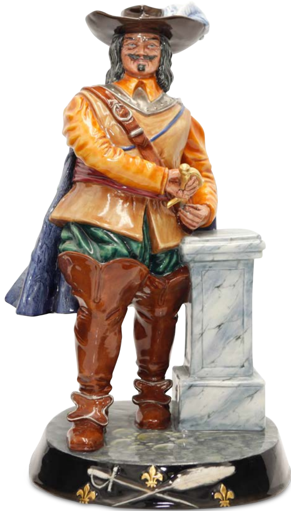
One of the Three Musketeers (Prototype) 10.75"H $5,500

A Royal Doulton Prototype figure of "Athos," one of the main characters in the 1844 Alexandre Dumas novel "The Three Musketeers." Modeled by Robert Tabbenor in 1978, this figure was part of a Three Musketeers series that was planned but not produced. Athos – noble, handsome, and secretive – is modeled wearing the uniform of the King's Musketeers.